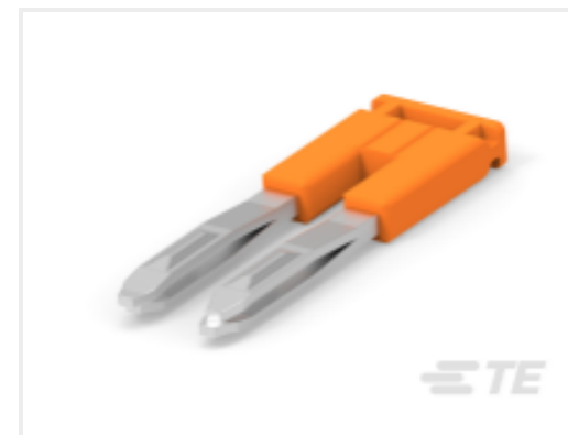
TE Part #1SNK905302R0000 JB5-2