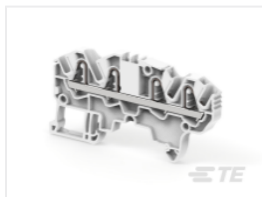
TE Part #1SNK705012R0000 ZK2.5-4P