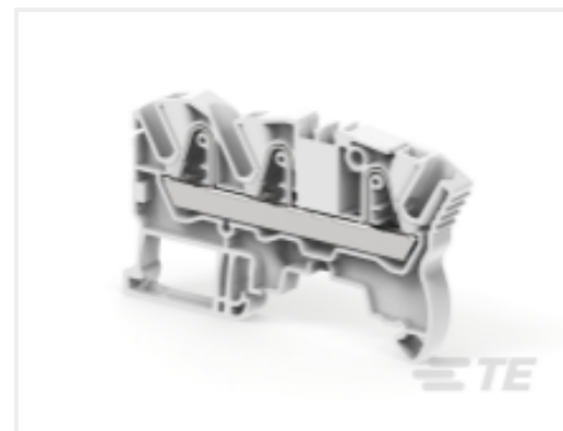
TE Part #1SNK706011R0000 ZK4-3P