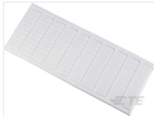
TE Part #1SNK148001R0000 MC512PA + (x100) Horizontal