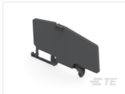
TE Part #1SNK900107R0000 CS-R3