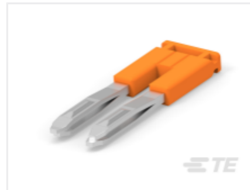
TE Part #1SNK906302R0000 JB6-2