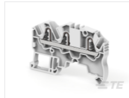
TE Part #1SNK705011R0000 ZK2.5-3P