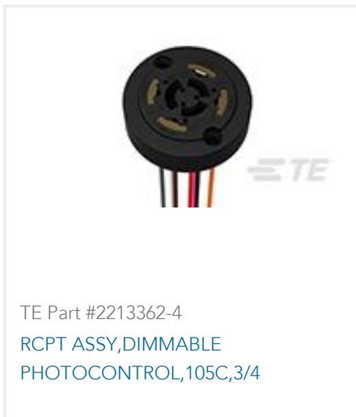
TE Part #2213362-4 RCPT ASSY,DIMMABLE PHOTOCONTROL,105C,3/4