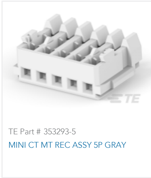
TE Part # 353293-5 MINI CT MT REC ASSY 5P GRAY