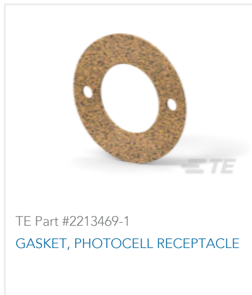
TE Part #2213469-1 GASKET, PHOTOCCELL RECEPTACLE