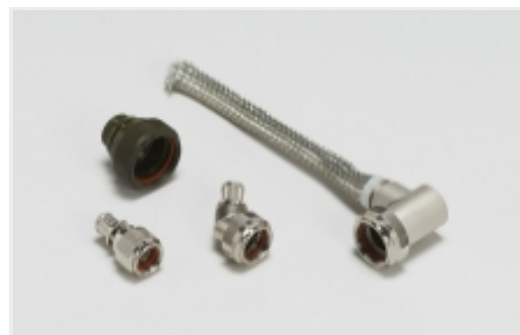
Ruggedized Backshells & Adapters (2016)