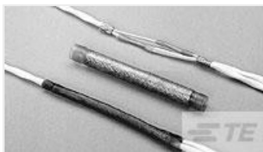
TE Part #544155-000 D-150-9133