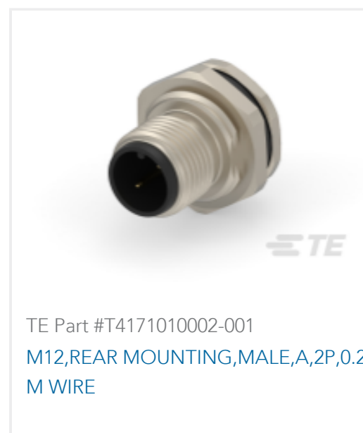
TE Part #T4171010002-001 M12,REAR MOUNTING,MALE,A,2P,0.2 M WIRE