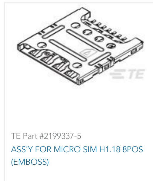
TE Part #2199337-5 ASS'Y FOR MICRO SIM H1.18 8POS (EMBOSS)