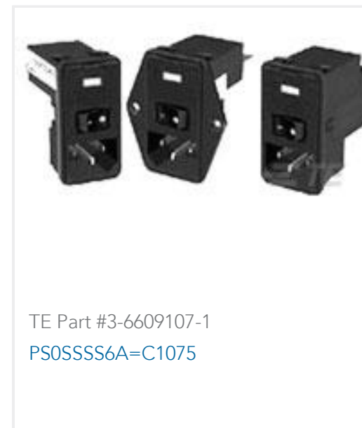
TE Part #3-6609107-1 PS0SSSS6A=C1075