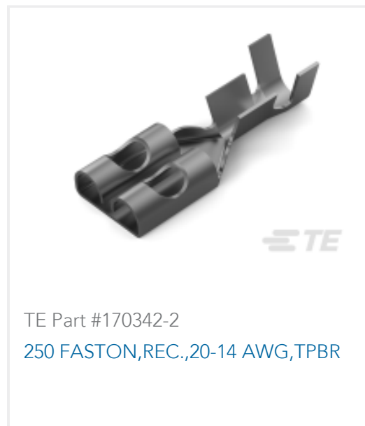
TE Part #170342-2 250 FASTON,REC.,20-14 AWG,TPBR