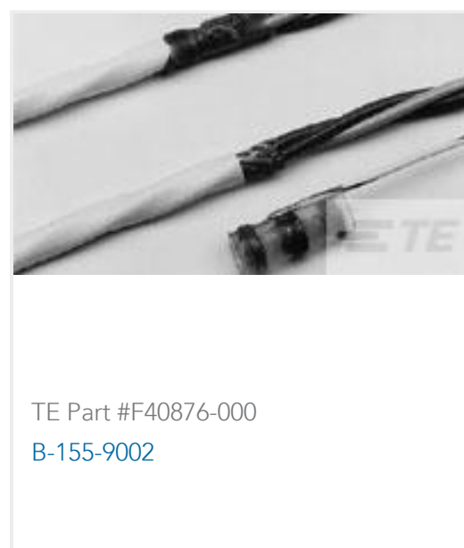
TE Part #F40876-000 B-155-9002