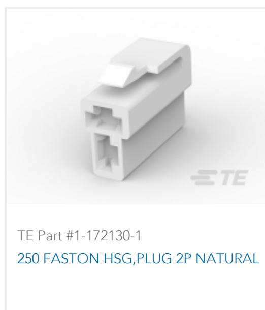
TE Part #1-172130-1 250 FASTON HSG,PLUG 2P NATURAL