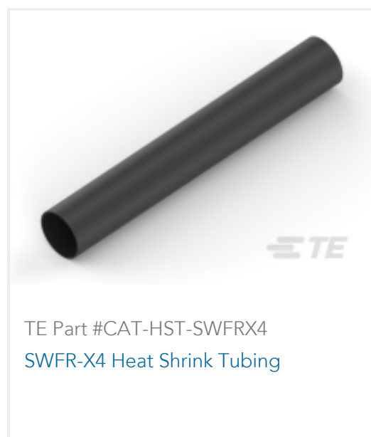
TE Part #CAT-HST-SWFRX4 SWFR-X4 Heat Shrink Tubing