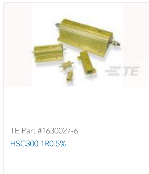
TE Part #1630027-6 HSC300 1R0 5%