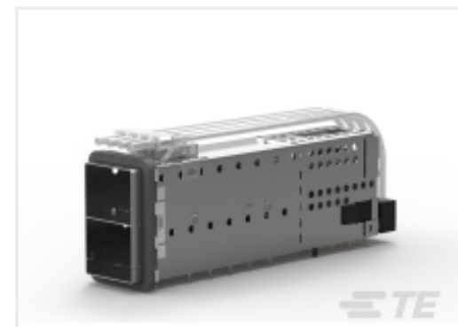
TE Part # 4-2296273-2 MICROQSFP 2X1 CAGE ASSY EMI GASKET, 4LP