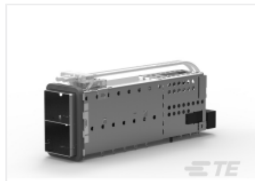
TE Part # 2-2296273-2 MICROQSFP 2X1 CAGE ASSY EMI GASKET, 2LP