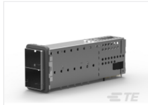
TE Part # 2296273-2 MICROQSFP 2X1 CAGE ASSY EMI GASKET