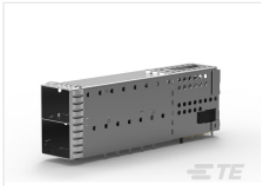
TE Part # 2296273-1 MICROQSFP 2X1 CAGE ASSY EMI SPRING