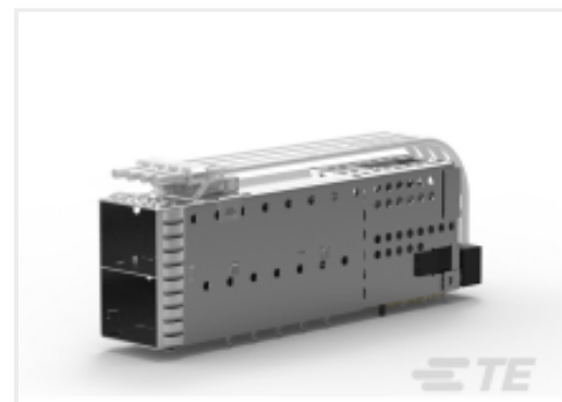
TE Part # 4-2296273-1 MICROQSFP 2X1 CAGE ASSY EMI SPRING, 4LP