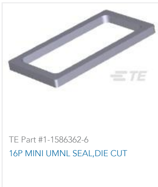
TE Part #1-1586362-6 16P MINI UMNL SEAL,DIE CUT