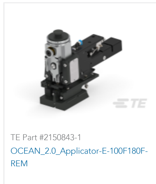
TE Part #2150843-1 OCEAN_2.0_Applicator-E-100F180F-REM