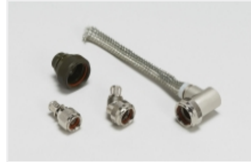
Ruggedized Backshells & Adapters (2044)