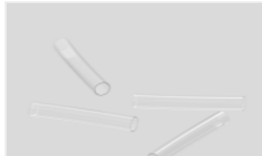
TE Part #CAT-HST-RW175-E RW-175-E Heat Shrink Tubing