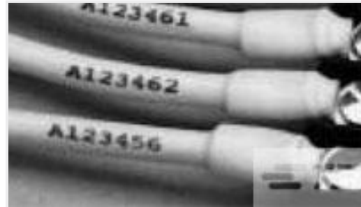
TE Part #5053274018 RNF-100-3/4-6-SP