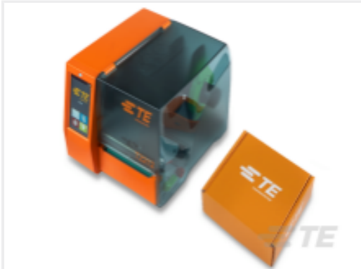
TE Part #1-2186528-1 T2212-SWARE-PRINTER