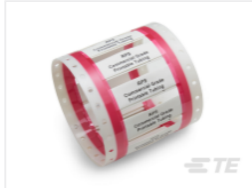
TE Part #CAT-T3437-R819 RPS Commercial Grade Sleeves