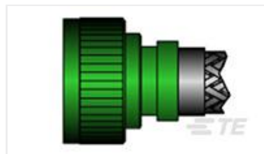
TE Part #570371-000 203M012-19B04