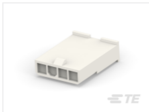
TE Part # 2029180-4 4P PLUG SR VAL-U-LOK FH GW