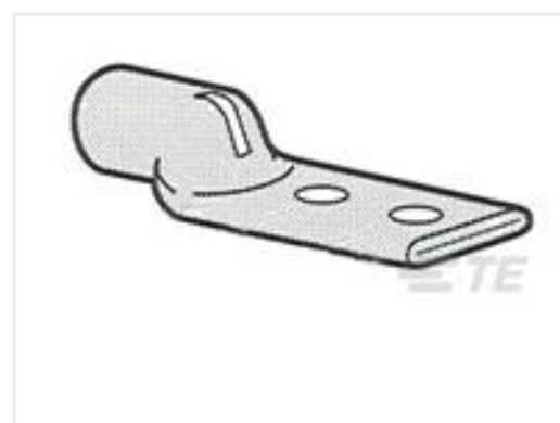
TE Part #55992-1 TERMINAL,AMPOWER R 2/0 5/16