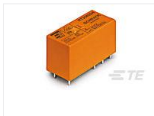
TE Part #1-1415543-5 RTE44110