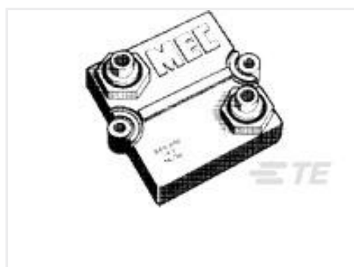
TE Part #1614770-4 BDS 2 A 250 10R 10%