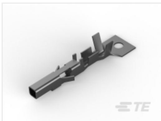
TE Part # 1586317-1 VAL-U-LOK SKT BR SN 26-22 LP