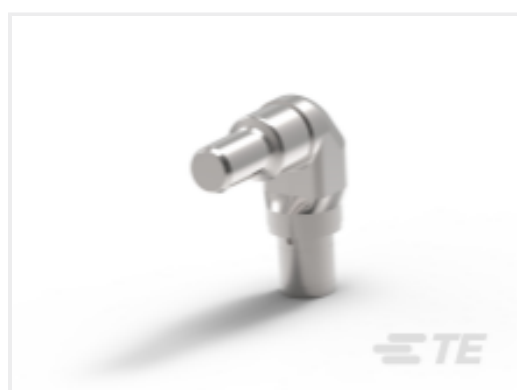
TE Part #ZPF00000000205378 CONTACT MALE ANG.90, CAL20, 120MM2 - FXP