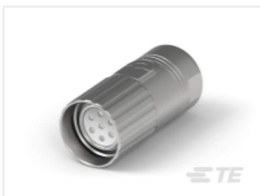
TE Part #ASA158F12390235000 623 PLUG