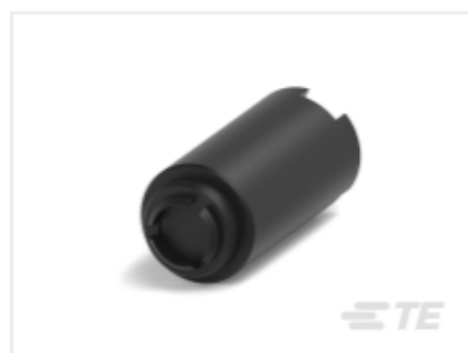
TE Part #YZ-KC-212751A-PY00 TOOL DISMOUNTING - FXP2