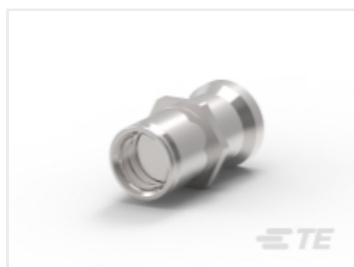
TE Part #ZPF00000000205388 CONTACT FEMALE CAL.20, M12 - FXP