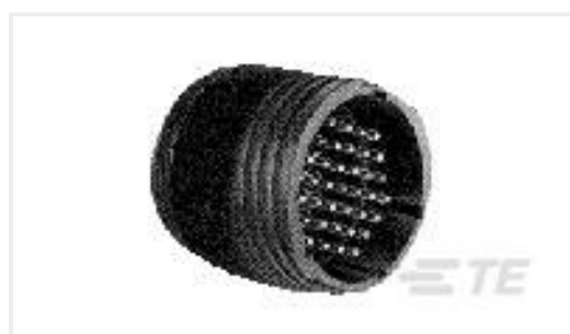
TE Part #206705-2 CPC 13-9 FREE HANGING RECPT