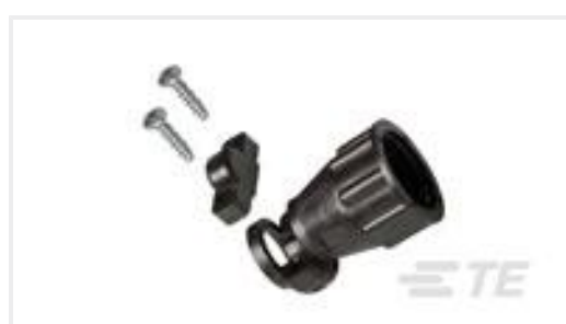
TE Part #1-206062-6 CABLE CLAMP KIT #11