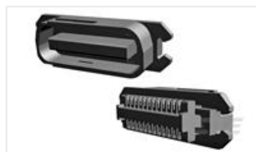
TE Part #552274-1 ASSY, PLUG, 36 POS, B SLOT