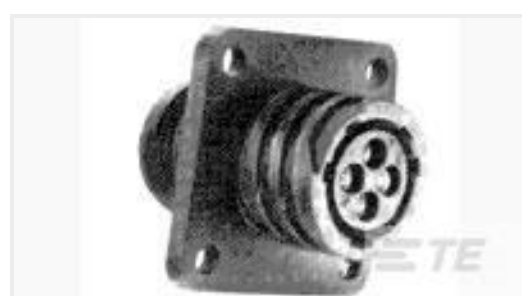
TE Part #206043-1 RECEPT,SZ 17-14 CPC