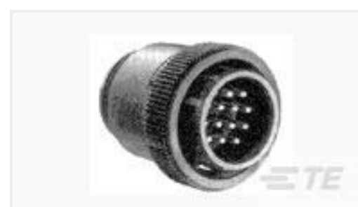
TE Part #206429-1 CPC PLUG ASSY, 11-4, REV SEX