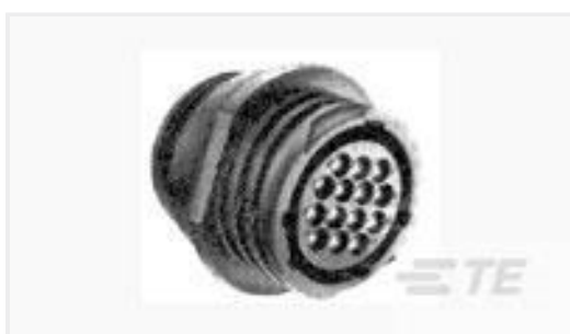
TE Part #206430-2 CPC 11-4 Free Hanging Receptacle