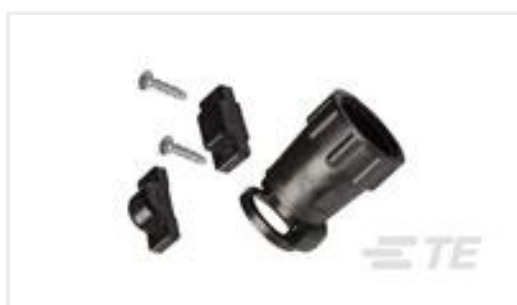
TE Part #206966-7 CABLE SHELL CLAMP SIZE 13