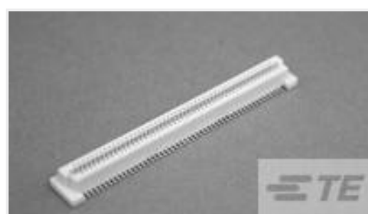
TE Part #5177983-1 0.8FH,R05H.5,040,08/Sn,TU