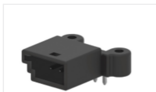
TE Part #CAT-SIGH262 Signal Header