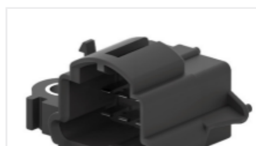
TE Part #CAT-LMPH9507 Low & Medium Power Header