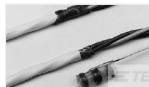
TE Part #615595-000 B-150-07-S