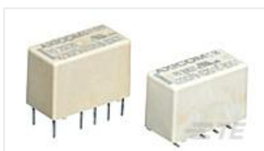
TE Part #1393788-3 V23079A1001B301