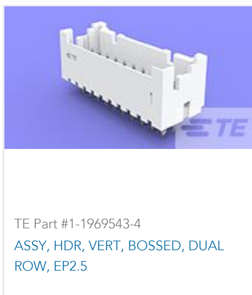
TE Part #1-1969543-4 ASSY, HDR, VERT, BOSSED, DUAL ROW, EP2.5