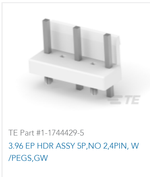
TE Part #1-1744429-5 3.96 EP HDR ASSY 5P,NO 2,4PIN, W /PEGS,GW