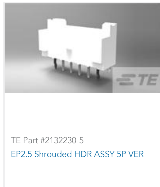
TE Part #2132230-5 EP2.5 Shrouded HDR ASSY 5P VER