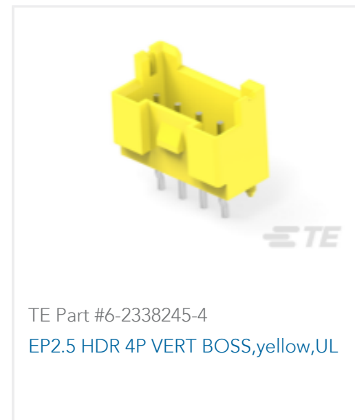
TE Part #6-2338245-4 EP2.5 HDR 4P VERT BOSS,yellow,UL