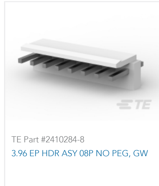
TE Part #2410284-8 3.96 EP HDR ASY 08P NO PEG, GW