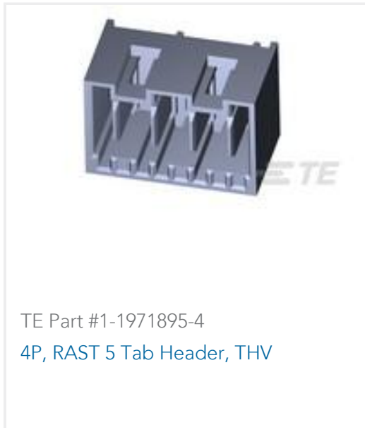
TE Part #1-1971895-4 4P, RAST 5 Tab Header, THV