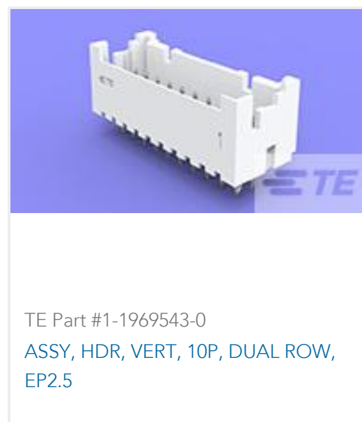
TE Part #1-1969543-0 ASSY, HDR, VERT, 10P, DUAL ROW, EP2.5