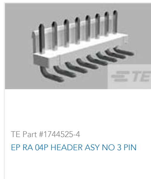
TE Part #1744525-4 EP RA 04P HEADER ASY NO 3 PIN