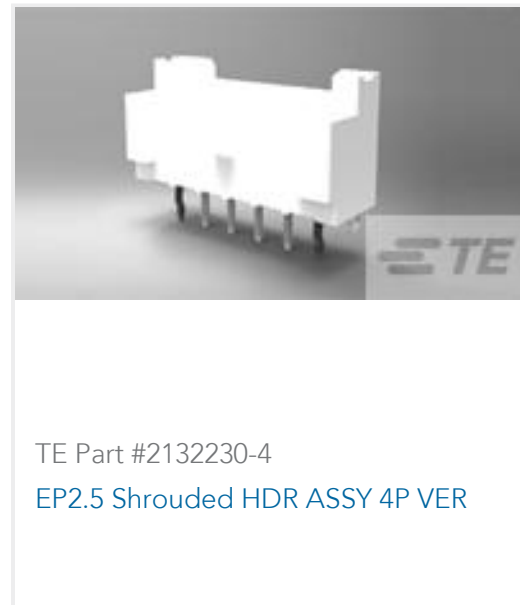
TE Part #2132230-4 EP2.5 Shrouded HDR ASSY 4P VER