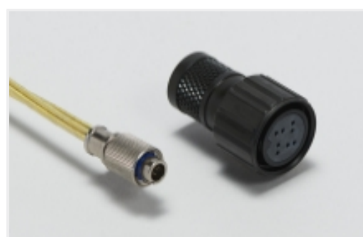
Standard Circular Connectors(45)