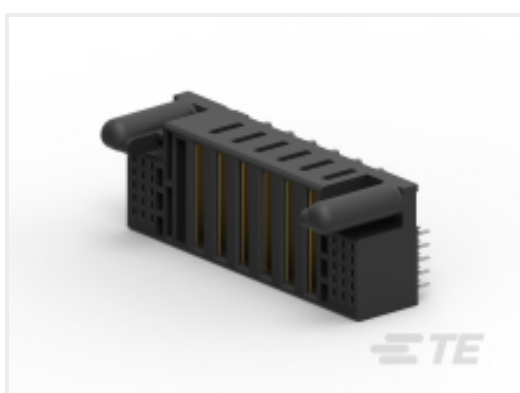
TE Part # 2204422-3 MULTI-BEAM HD VER.REC. 15S+6P+2LP+15S