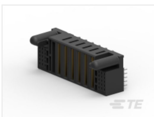
TE Part #2204422-3 MULTI-BEAM HD VER.REC. 15S+6P+2LP+15S