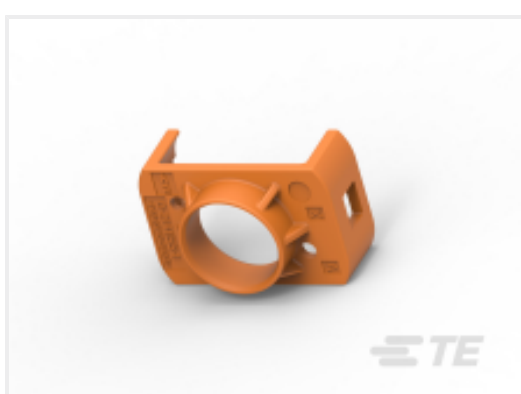
TE Part #2141155-1 PROTEC. COVER 8MM HV,90DEG