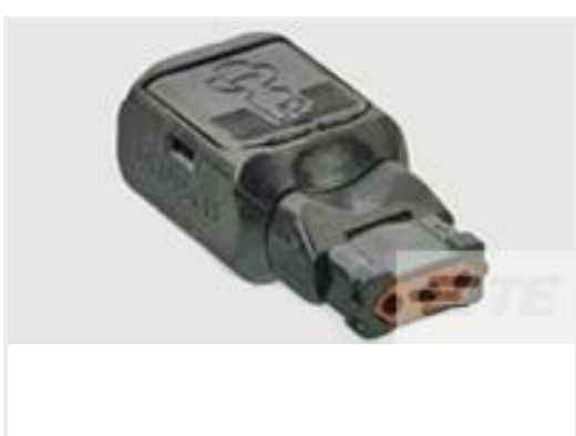
TE Part #D369-R33-AS0 369 3 WAY REC, NO CONTACTS, SKT