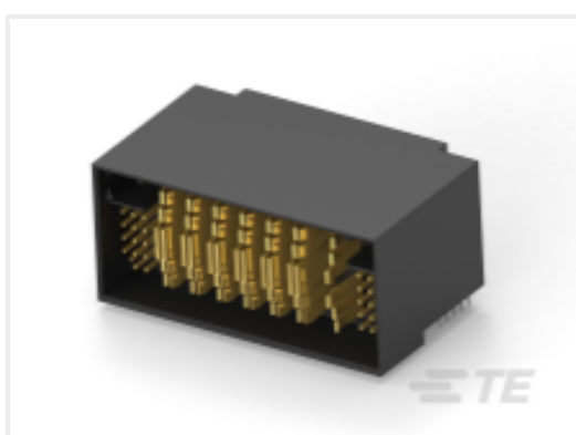
TE Part # 2204452-2 MULTI-BEAM HD R/A PLUG 15S+2LP+6P+15S