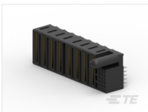
TE Part # 2204426-1 MULTI-BEAM HD VERTICAL REC. 15S+4P+4P