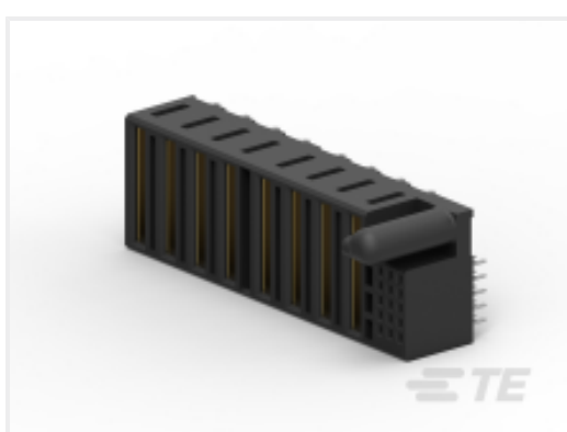
TE Part #2204426-1 MULTI-BEAM HD VERTICAL REC. 15S+4P+4P