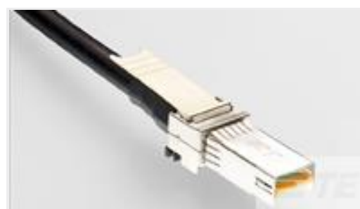
TE Part # 2142970-4 CABLE ASSY, MICRO SFP+ TO STD SFP+, 3M