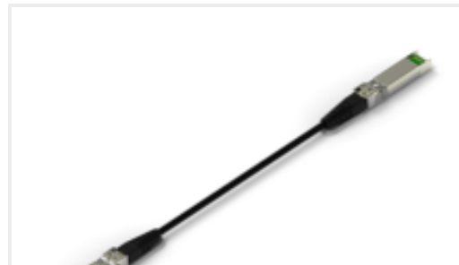
TE Part # CAT-C11-N4901114 SFP28 to SFP28 Cable Assembly: 30 AWG