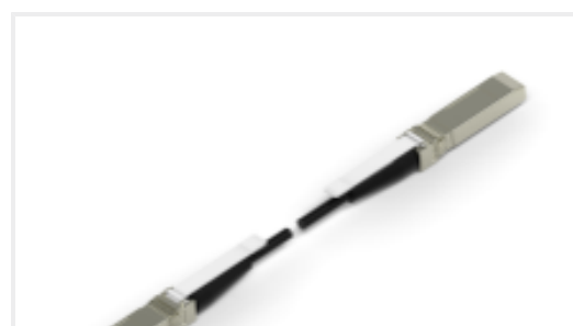
TE Part # CAT-C11-H5062 SFP+ to SFP+ I/O Cable Assembly: 28 AWG