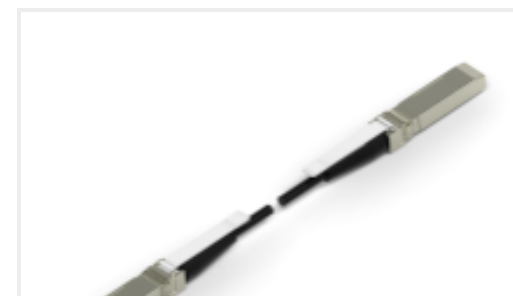
TE Part # CAT-C11-H5 SFP+ to SFP+ I/O Cable Assembly: 24 AWG