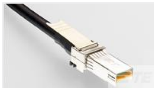
TE Part # 2142970-5 CABLE ASSY, MICRO SFP+ TO STD SFP+, 4M