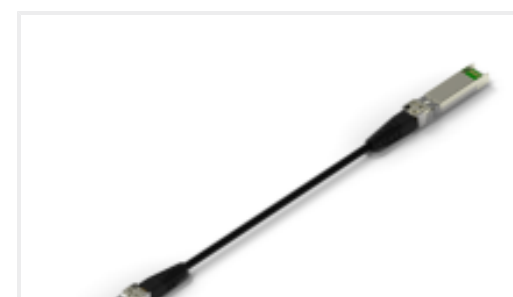
TE Part # CAT-C11-N49011 SFP28 to SFP28 Cable Assembly: 26 AWG