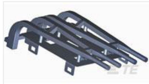
TE Part # 2007182-1 SFP Standard 1x2 Light Pipe Assm