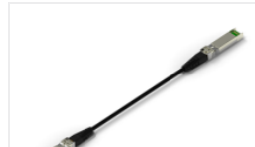
TE Part # 4-2821222-5 SFP56 DIRECT ATTACH CA, 2M, 30AWG