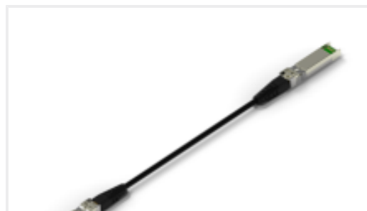
TE Part # 4-2821224-5 SFP56 DIRECT ATTACH CA, 3M, 26AWG