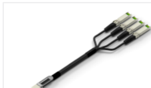
TE Part # CAT-Q17-N49011 QSFP56-Four SFP56 Cable Assembly: 30 AWG