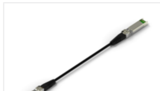
TE Part # 2334985-2 SFP28 DIRECT ATTACH CA, 1M, 32AWG