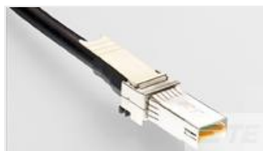
TE Part # 2142970-2 CABLE ASSY, MICRO SFP+ TO STD SFP+, 1M