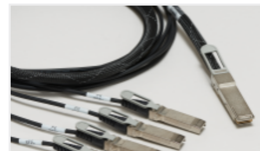
TE Part # 2821033-8 QSFP TO [4]SFP+, 28G, 1M, 33AWG