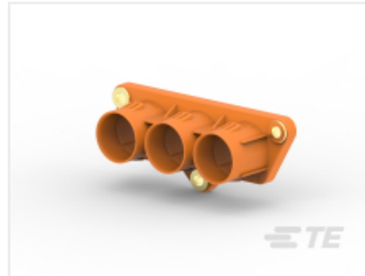
TE Part #2141783-2 3POS,RING TONGUE,HSG,ASSY, SEALED