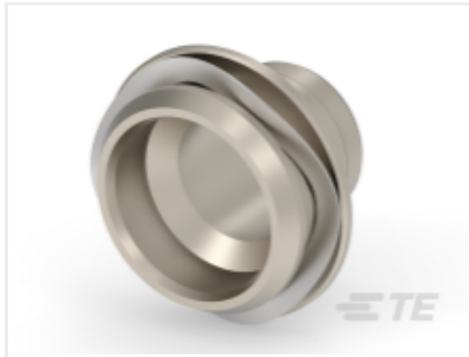
TE Part #2364825-1 ALU,SHIELD ASSY,IPT,CONN HSG, 180DEG