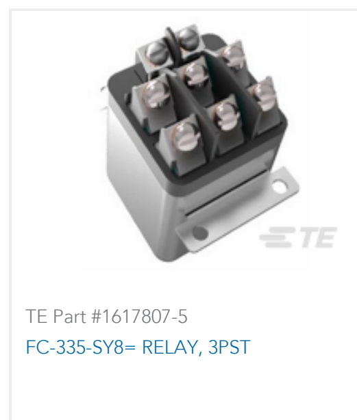
TE Part #1617807-5 FC-335-SY8= RELAY, 3PST