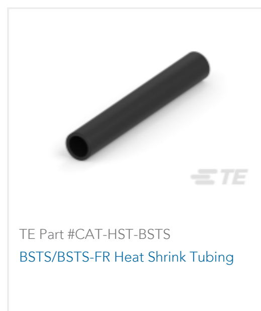
TE Part #CAT-HST-BSTS BSTS/BSTS-FR Heat Shrink Tubing