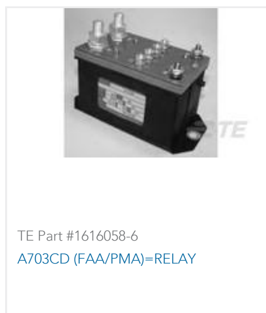
TE Part #1616058-6 A703CD (FAA/PMA)=RELAY