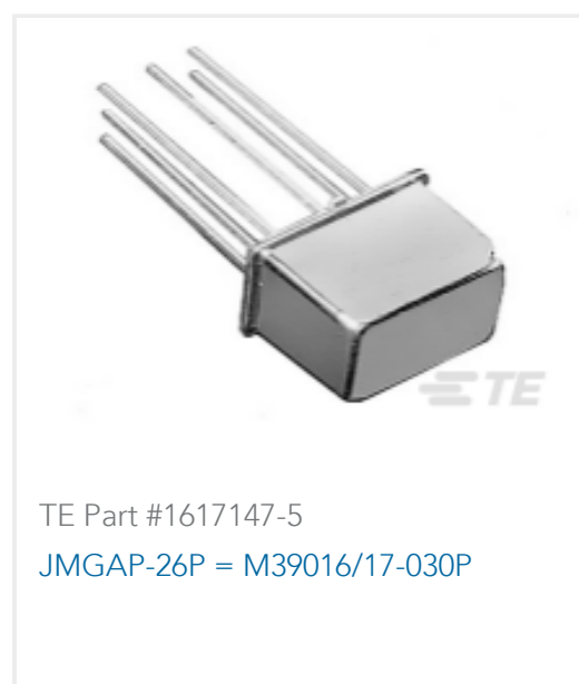
TE Part #1617147-5 JMGAP-26P = M39016/17-030P