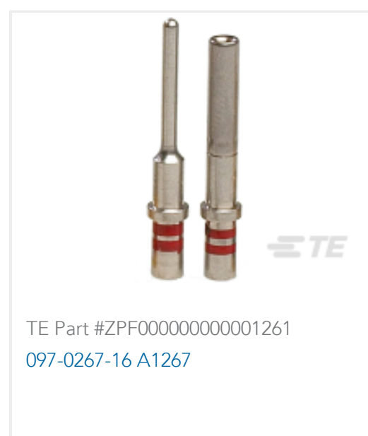
TE Part #ZPF000000000001261 097-0267-16 A1267