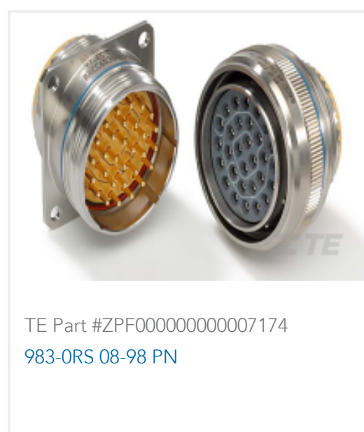
TE Part #ZPF000000000007174 983-ORS 08-98 PN