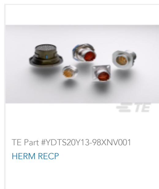
TE Part #YDTS20Y13-98XNV001 HERM RECP