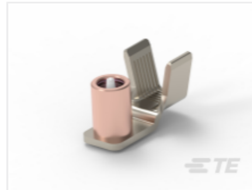
TE Part # 2137715-3 11MM HV, TERMINAL ASSY 90DEG