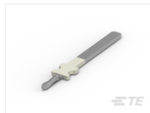
TE Part # 1394353-2 FLACHSTE A-P 1,5