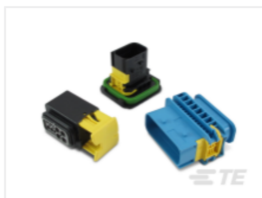
TE Part # CAT-H3399-CH8172 Heavy Duty Sealed Connector Series Housings