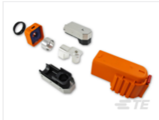
TE Part # YHVP1100-1P-90-A-0 HVP1100-1phi XE,90,Key A