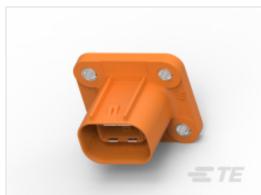
TE Part # 1-2103124-1 HEADER ASSY, Ag SHIELD, KEY A, HVA280-2P