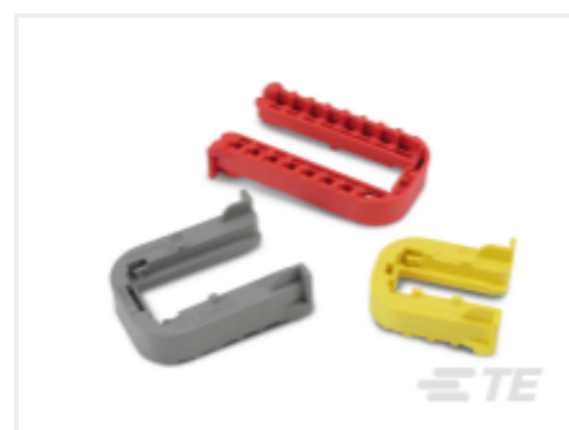
TE Part # CAT-H3399-SL34 Heavy Duty Sealed Connector Series Fixing Slides