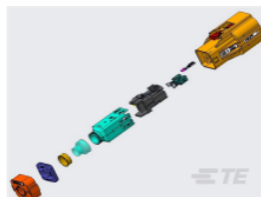
TE Part # YHVA630-2PHM-6MM-A HVA630-2pmm, 6sqmm, Key A