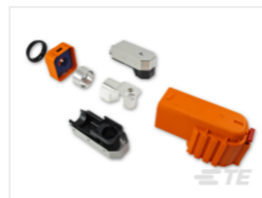
TE Part # YHVP1100-1P-90-A-0 HVP1100-1phi XE,90,Key A