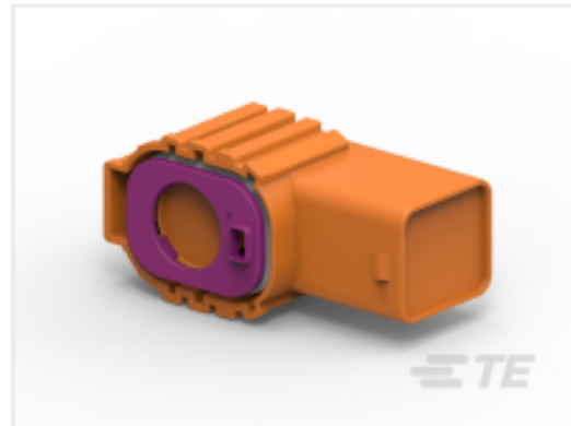
TE Part # 2137704-1 HVP1100 1POS PLUG HSG ASSY SLD 90 DEG