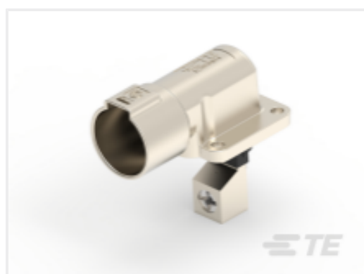
TE Part # 2394070-2 1POS, HVP1000, ASSY, 90DEG, COD B