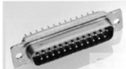
TE Part #443975-4 AMPLIMITE, RCPT ASY, POSTD, 109,4