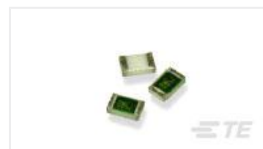
TE Part #1-1879417-4 CPF 0603 620K 0.1% 25PPM 1K RL