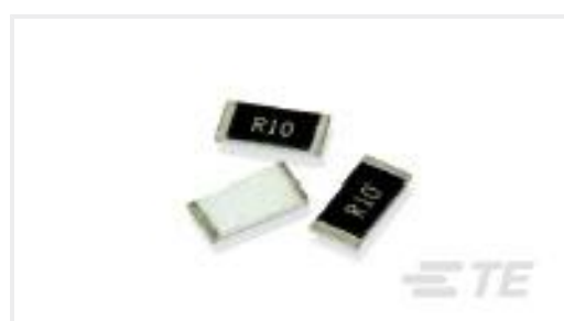
TE Part #3-2176053-0 RLP73K 2A R82 1% 1K RL