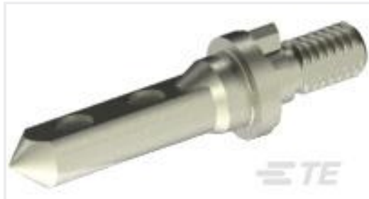
TE Part #1-1469491-2 MULTIGIG RT GUIDE PIN, 9MM 2.60