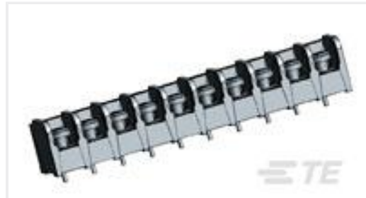
TE Part #3-1437658-3 8PCV-10-006=738010600