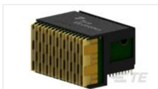
TE Part #1410187-3 MULTIGIG RT T2 7RW DC DF CT