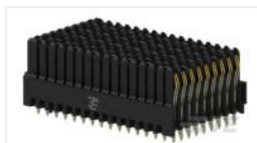
TE Part #1410141-1 MULTIGIG RT T2 .8" BP FULL LEF