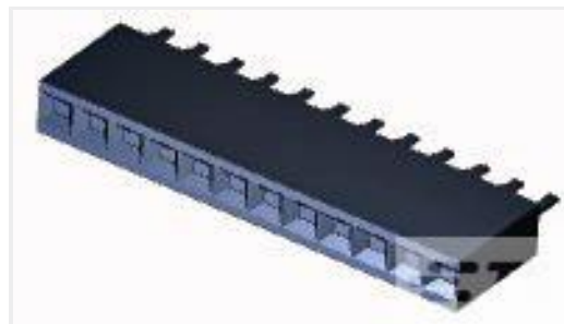
TE Part #6-534237-0 12 MODII VRT SR CE 100/115