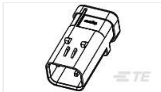
TE Part #776536-1 AS16,CAP ASSY,ST,04P,E SEAL,CODE A