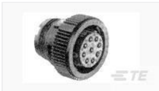
TE Part #206485-1 CPC PLUG ASSEMBLY SIZE 11-9