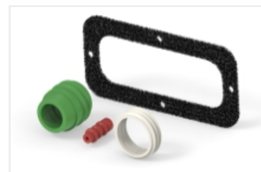
Connector Seals & Cavity Plugs(35)