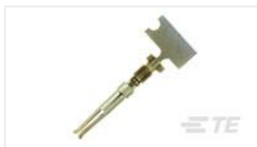
TE Part #66504-9 SOCKET CONTACT, 20 DF