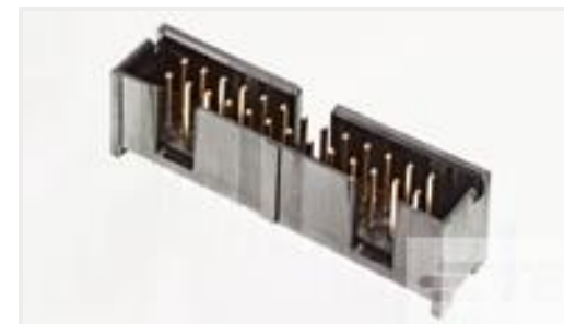
TE Part #5103308-7 A/L LOW PRO HDR 34P VERT BLACK