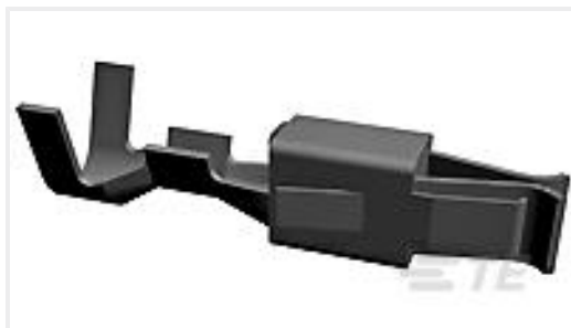
TE Part #927766-3 JPT REC 2.8 Contact SWS Sn