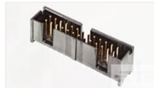
TE Part #1-103309-0 050 LOPRO HDR SP 30DP