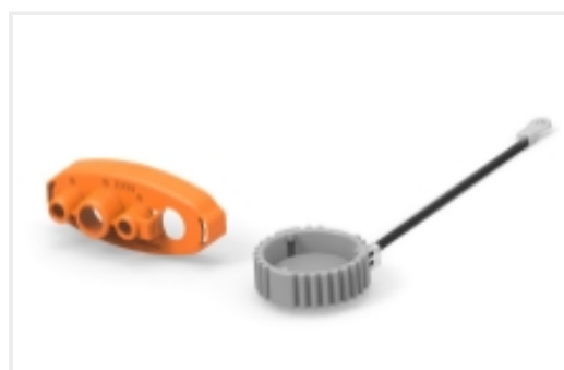
Connector Caps & Covers(16)