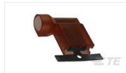
TE Part #2-520129-2 ULTRAFAST 250 ASSY FLAG 22-18 TPBR LP