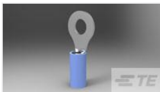
TE Part #321045 TERMINAL,PIDG R 16-14 1/4