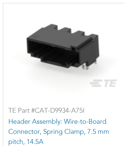
TE Part #CAT-D9934-A75I Header Assembly: Wire-to-Board Connector, Spring Clamp, 7.5 mm pitch, 14.5A