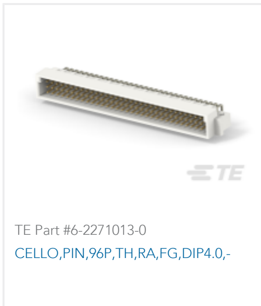
TE Part #6-2271013-0 CELLO, PIN, 96P, TH, RA, FG, DIP4.0, -