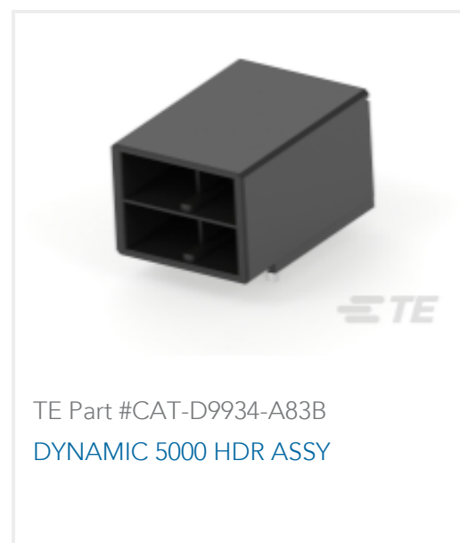
TE Part #CAT-D9934-A83B DYNAMIC 5000 HDR ASSY