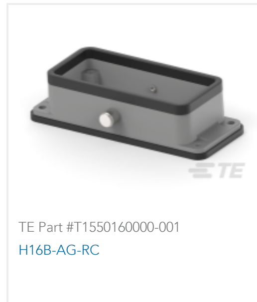
TE Part #T1550160000-001 H16B-AG-RC