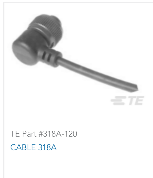
TE Part #318A-120 CABLE 318A