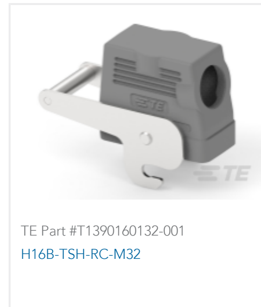
TE Part #T1390160132-001 H16B-TSH-RC-M32