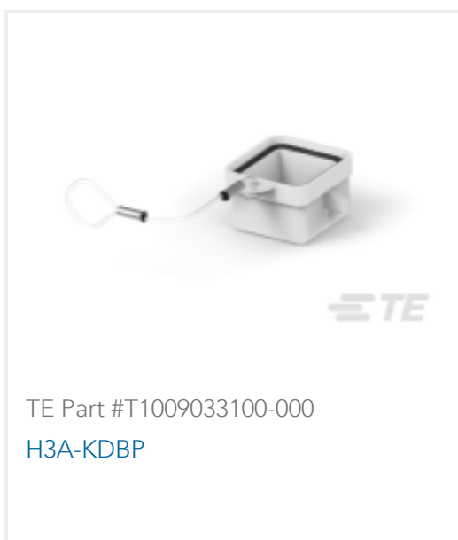
TE Part #T1009033100-000 H3A-KDBP