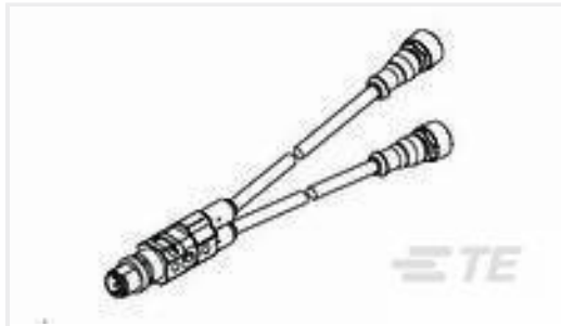
TE Part #2273107-3 M12 Y conn Male to 2xM12 Female A