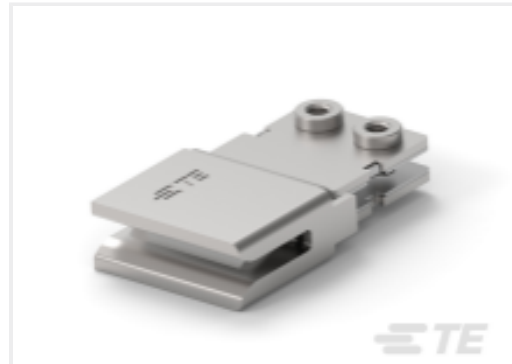
TE Part #2204761-1 IN-LINE MOUNT 300A BUSBAR CONN.