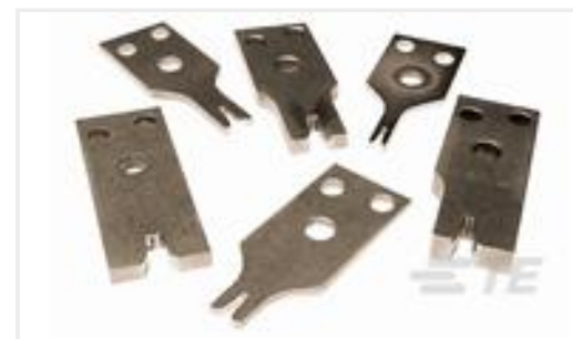
TE Part #456414-5 CRIMPER, WIRE .160 "F"