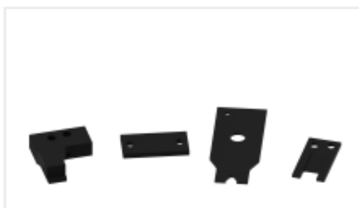
TE Part #240833-2 PLATE, REAR SHEAR