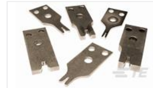
TE Part #854830-5 CRIMPER,INSULATION SP(.140 OV)