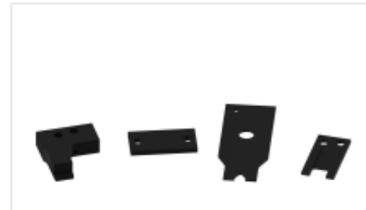
TE Part #2-690495-6 FRONT SHEAR PLATE