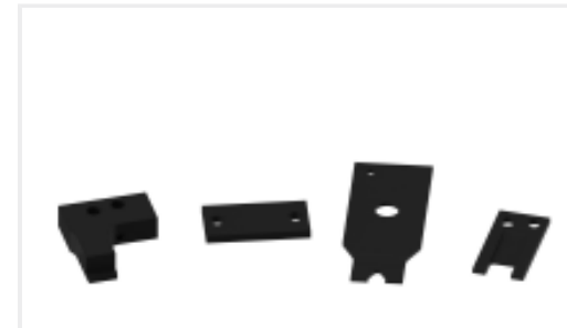
TE Part #690495-3 FRONT SHEAR PLATE