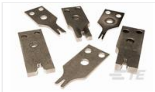
TE Part #1-456408-9 CRIMPER, WIRE .110 "F"