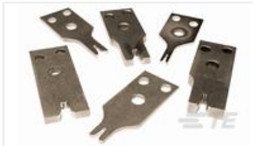
TE Part #6-1213077-9 CRIMPER, INSULATION "F"