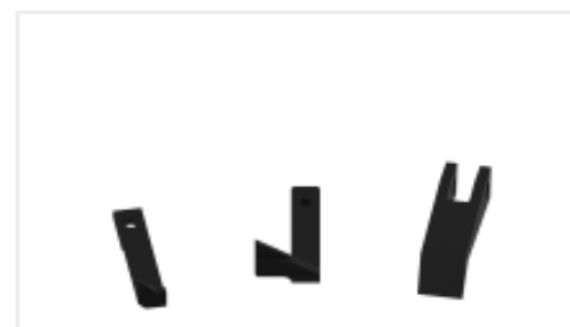
TE Part #240635-1 FINGER, FEED