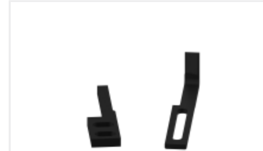
TE Part #690472-2 STRIPPER