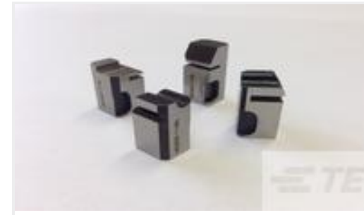
TE Part #454276-1 FLOATING SHEAR