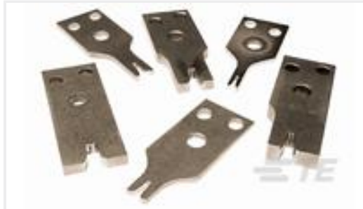
TE Part #9-456134-4 CRIMPER, INSULATION "F" (.080")