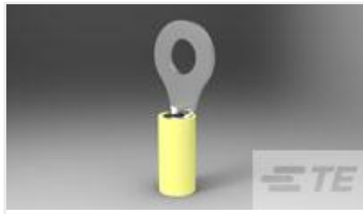
TE Part #35110 TERM, RT, PIDG, 12-10, 1/4