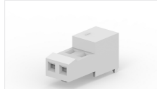
TE Part #CAT-104MTA-NTPNR MTA Receptacle: Nylon, Tin Plated, 2.54 mm