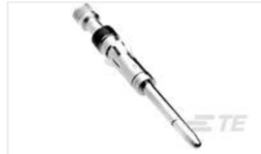
TE Part #200336-1 CONTACT PIN ASSY.