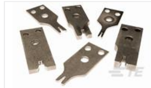
TE Part #2-1213077-5 CRIMPER, INSULATION "F" .055