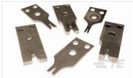
TE Part #4-1803018-1 INSULATION CRIMPER