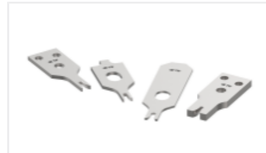
TE Part #8-1803470-8 CRIMPER, WIRE F