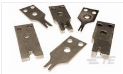
TE Part #808830-2 CRIMPER, SEMI-FLAT