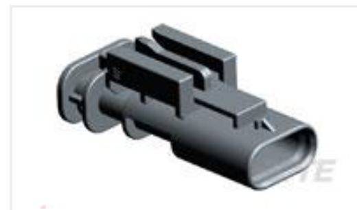
TE Part #2-1703494-2 3POS, MCON 1.2 LL TAB SEALED COD B