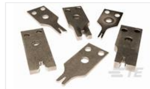
TE Part #4-456135-1 CRIMPER, INSULATION "O" (.062)