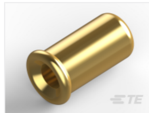
TE Part #CAT-377-MSSCB65 Miniature Spring Sockets: Closed Bottom, Beryllium Copper, 6.5A