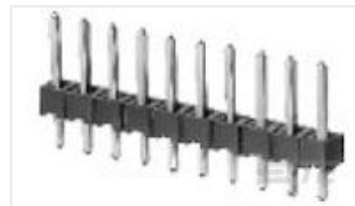
TE Part #5-146282-6 06 MODII HDR SRST B/A .100CL