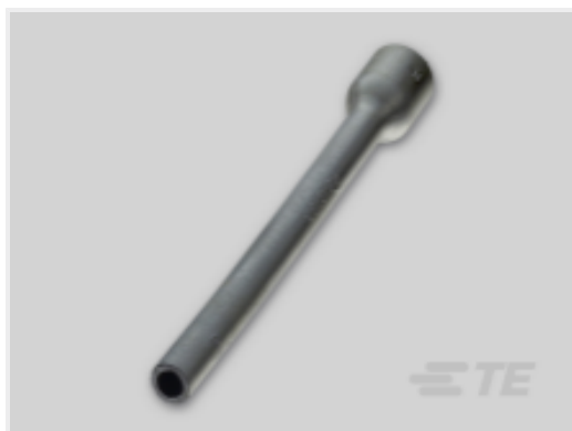
TE Part #CAT-R21-567014 Low Profile HS Boots: Blow Molded, Slim Line, Lipped, Straight