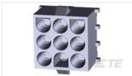
TE Part #350990-4 09P UMNL HDR ASSY LNG/TL