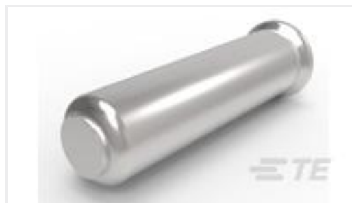
TE Part #3-331272-4 SOCKET,MIN-SPR W/KO AU SER-2