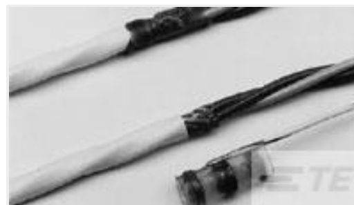
TE Part #625124-000 D-141-51