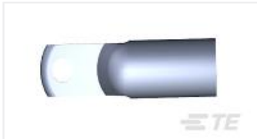
TE Part #134594-5 TERMINAL, COPALUM, SLD, 2/0, M8 STUD