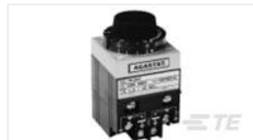
TE Part #1423165-2 7024AB=RLY,STD,OFF,4P,120VAC,5