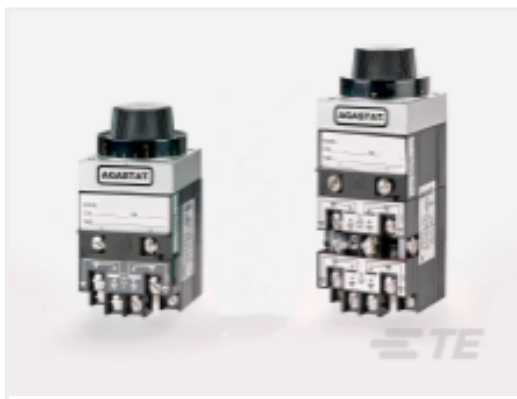
TE Part #4-1437450-3 7014NB=RLY,STD,ON,4P,48VDC,7