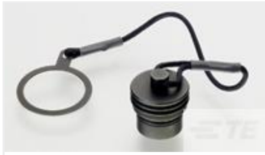
TE Part #2101579-2 DUST CAP,RCPT,Sz105,F SERIES