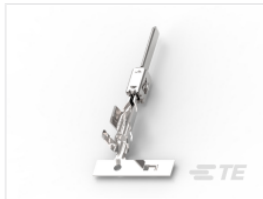
TE Part #2-2141600-2 TAB 2.8x0.8 CONTACT CF SRC Ag