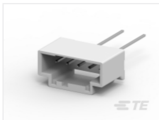
TE Part #5-2232546-1 GI2.5 HDR ASS 5P NC NO BOSS TAPE