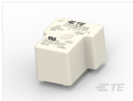
TE Part #2027395-5 T9W1K15-12S