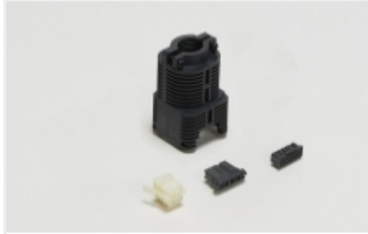
Rectangular Connector Housings(49)