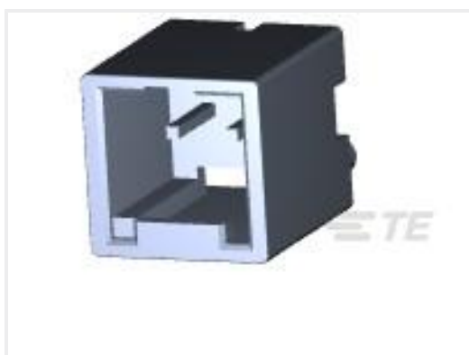
TE Part #2-1971800-4 NEW GI CONN2.5 HDR ASMBLY 2P YLW D1.5