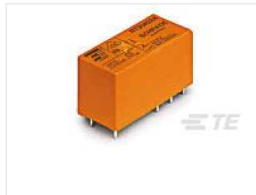
TE Part #1-1649357-3 RTH34012