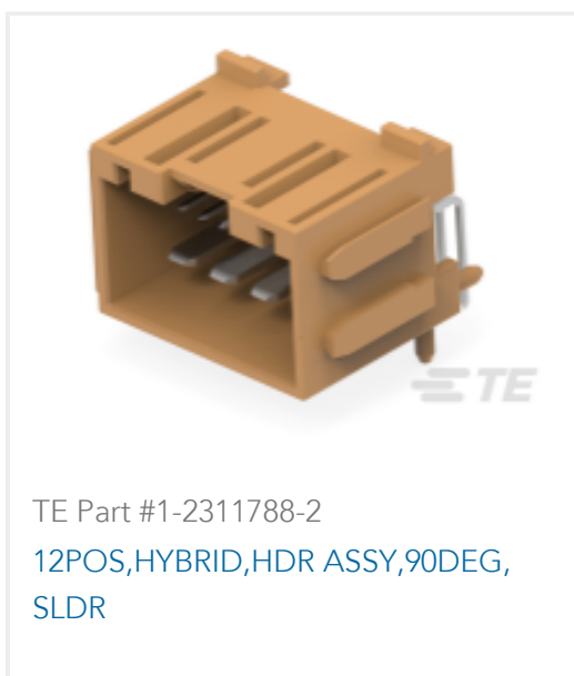
TE Part #1-2311788-2 12POS,HYBRID,HDR ASSY,90DEG, SLDR