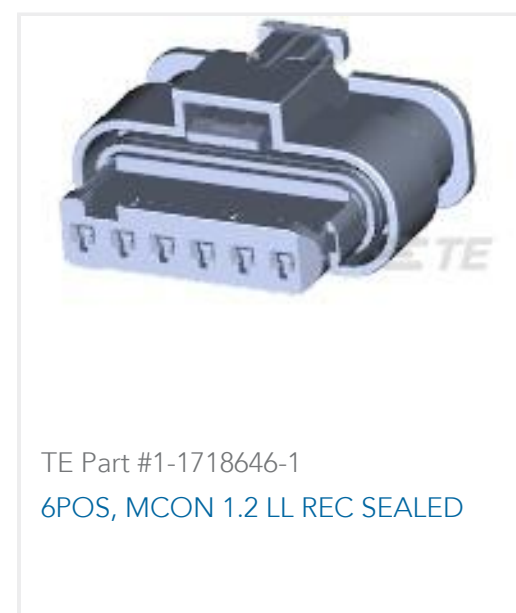
TE Part #1-1718646-1 6POS, MCON 1.2 LL REC SEALED