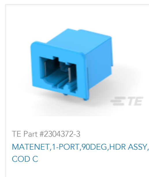
TE Part #2304372-3 MATENET,1-PORT,90DEG,HDR ASSY, COD C