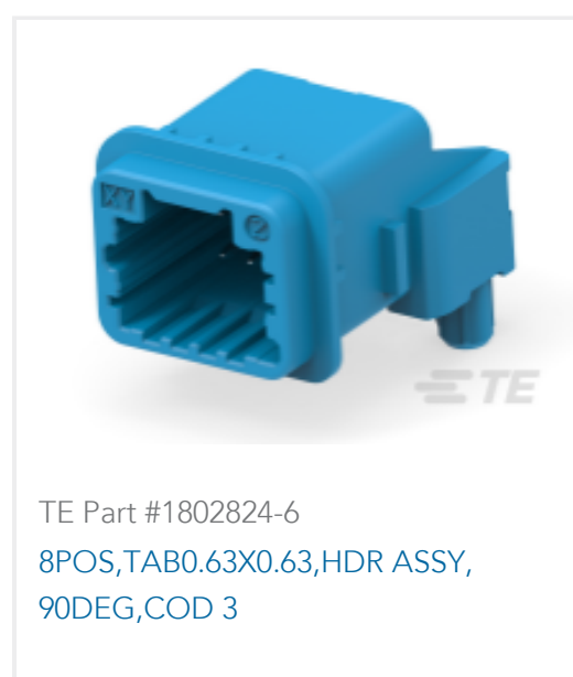
TE Part #1802824-6 8POS,TAB0.63X0.63,HDR ASSY, 90DEG,COD 3