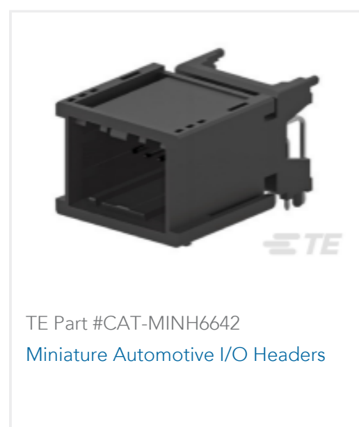
TE Part #CAT-MINH6642 Miniature Automotive I/O Headers