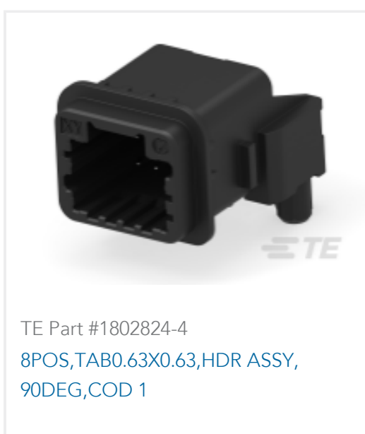
TE Part #1802824-4 8POS,TAB0.63X0.63,HDR ASSY, 90DEG,COD 1