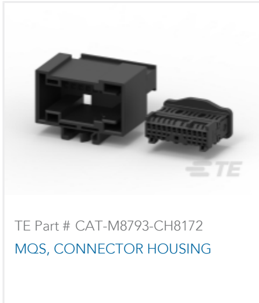
TE Part # CAT-M8793-CH8172 MQS, CONNECTOR HOUSING