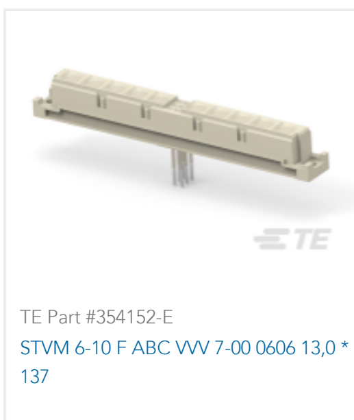
TE Part #354152-E STVM 6-10 F ABC WV 7-00 0606 13,0 * 137