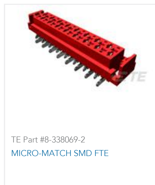
TE Part #8-338069-2 MICRO-MATCH SMD FTE