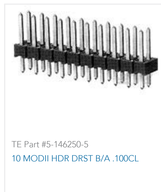
TE Part #5-146250-5 10 MODII HDR DRST B/A .100CL