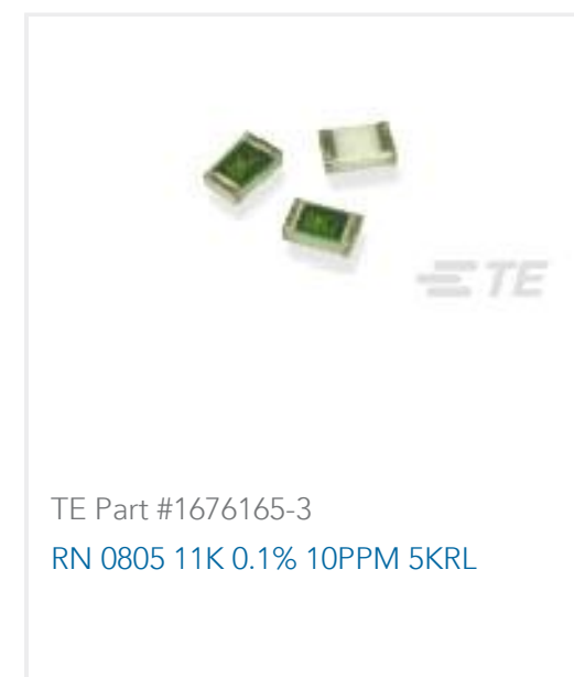
TE Part #1676165-3 RN 0805 11K 0.1% 10PPM 5KRL