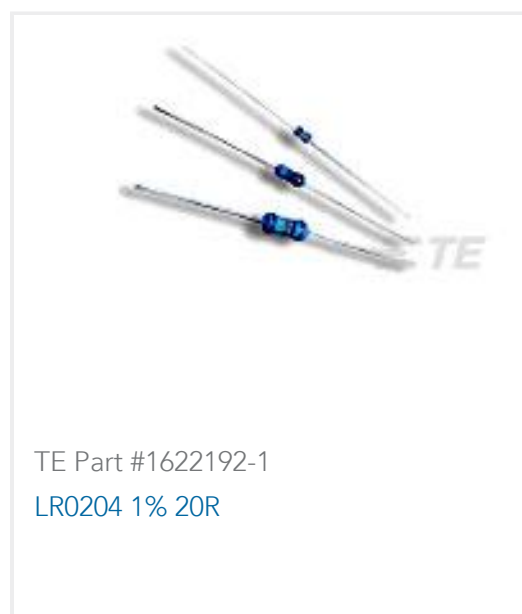
TE Part #1622192-1 LR0204 1% 20R