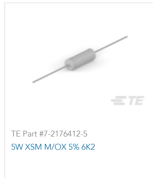
TE Part #7-2176412-5 5W XSM M/OX 5% 6K2