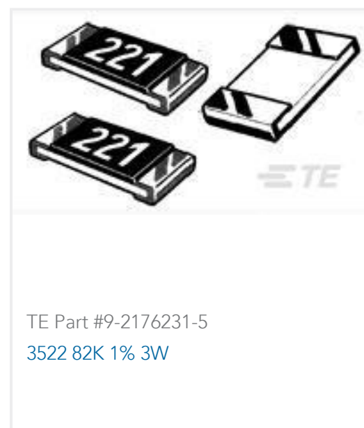
TE Part #9-2176231-5 3522 82K 1% 3W