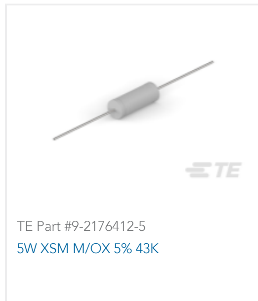
TE Part #9-2176412-5 5W XSM M/OX 5% 43K