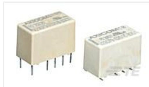
TE Part #4-1393789-3 V23079D2001B301