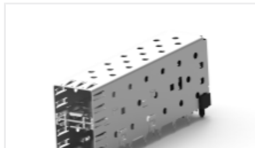
TE Part #1658628-2 PRESS FIT 2X1 REDUCED PROFILE