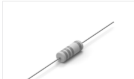
TE Part # 2-1625892-1 3W SM M/OX 5% 1K0