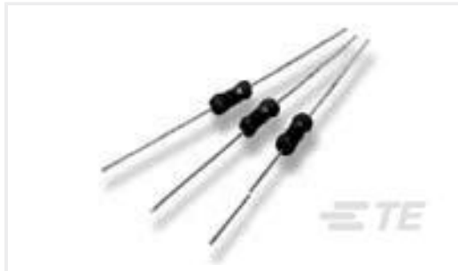
TE Part # 1625893-5 5W SM M/OX 5% 47K