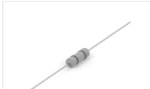
TE Part # 4-1625886-1 1W SM M/OX 5% 820K