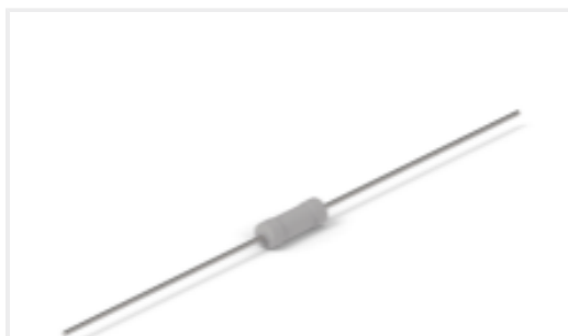
TE Part # 6-1676123-7 1/2W SM M/OX 5% 470R