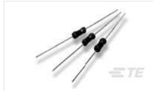
TE Part # 1625881-2 1W STD M/OX 2% 220R