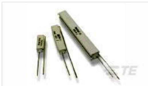
TE Part #2-1623729-6 BCHC 17 W 6K8 5%