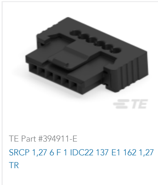
TE Part #394911-E SRCP 1,27 6 F 1 IDC22 137 E1 162 1,27 TR