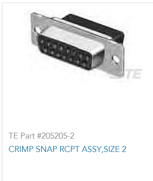
TE Part #205205-2 CRIMP SNAP RCPT ASSY, SIZE 2