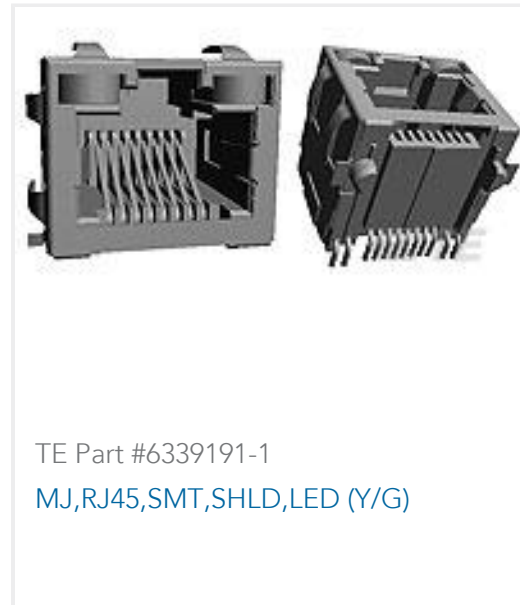
TE Part #6339191-1 MJ,RJ45,SMT,SHLD,LED (Y/G)