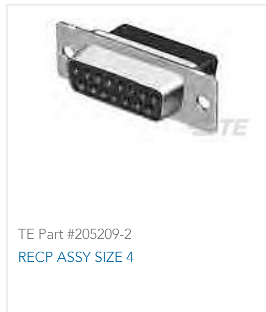
TE Part #205209-2 RECP ASSY SIZE 4