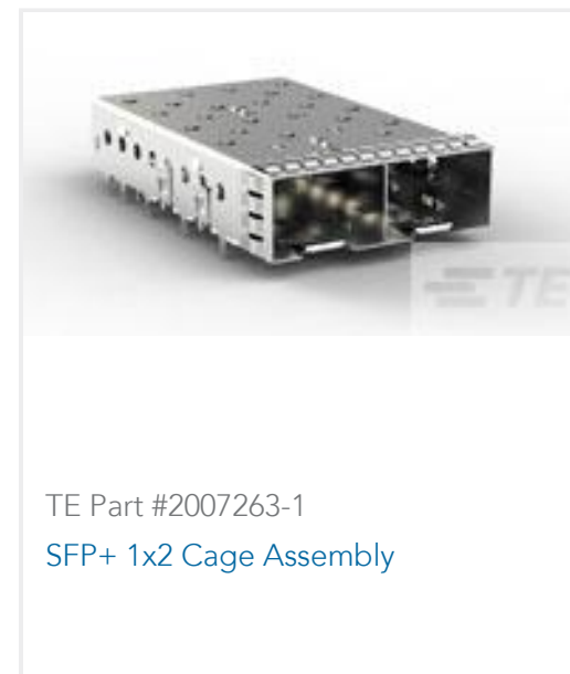
TE Part #2007263-1 SFP+ 1x2 Cage Assembly