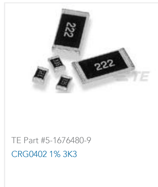
TE Part #5-1676480-9 CRG0402 1% 3K3