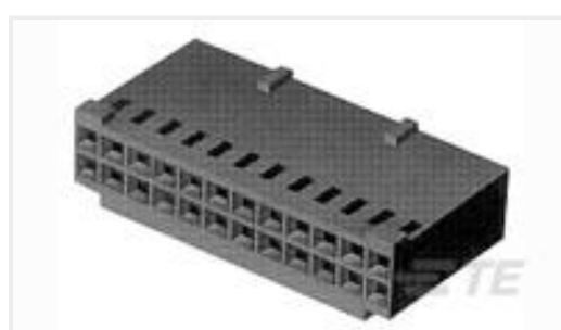
TE Part #1-87977-0 24 MODIV HSG DR MRKD .100 POL