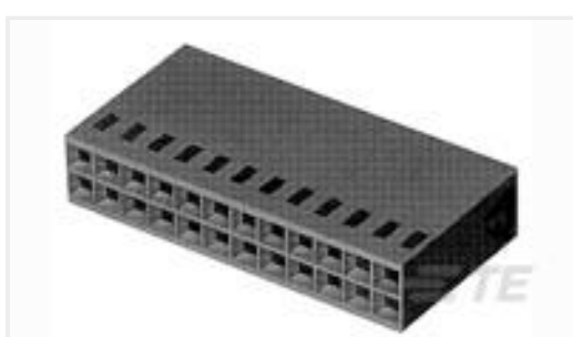
TE Part #87456-5 10 MODIV HSG COMP DR .100CL