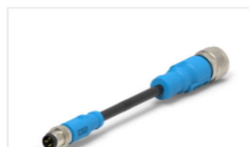
TE Part #T4052117004-001 RPC-M8-4MS-0.5-M12-4FS-PVC