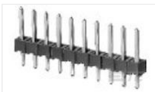
TE Part #9-146276-0 40 MODII HDR SRST B/A .100CL