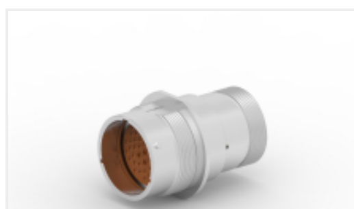
TE Part #HD34-24-47PE-072 REC, 47P, AL, E, THD ADPT DRAIN, 16 /20,P