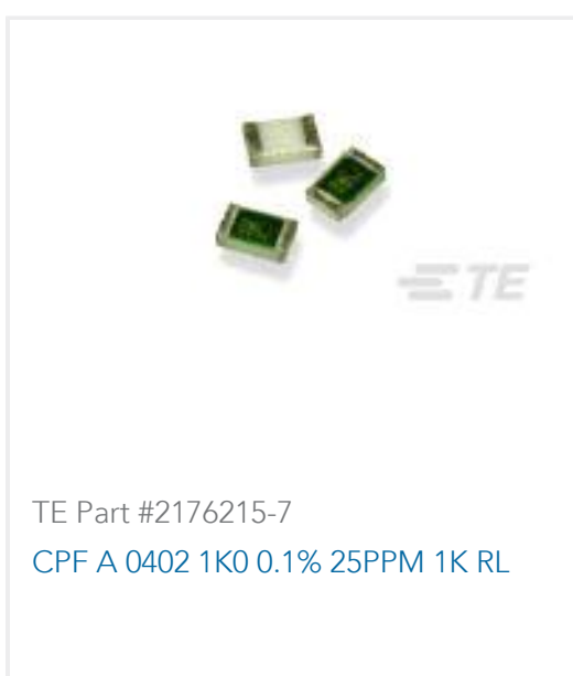
TE Part #2176215-7 CPF A 0402 1K0 0.1% 25PPM 1K RL