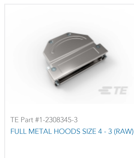
TE Part #1-2308345-3 FULL METAL HOODS SIZE 4 - 3 (RAW)