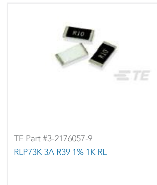
TE Part #3-2176057-9 RLP73K 3A R39 1% 1K RL