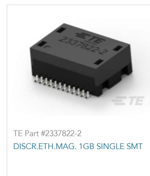
TE Part #2337822-2 DISCR.ETH.MAG. 1GB SINGLE SMT