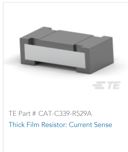
TE Part # CAT-C339-R529A Thick Film Resistor: Current Sense