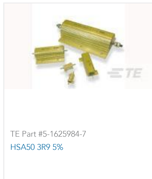
TE Part #5-1625984-7 HSA50 3R9 5%