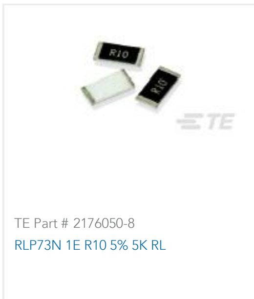
TE Part # 2176050-8 RLP73N 1E R10 5% 5K RL