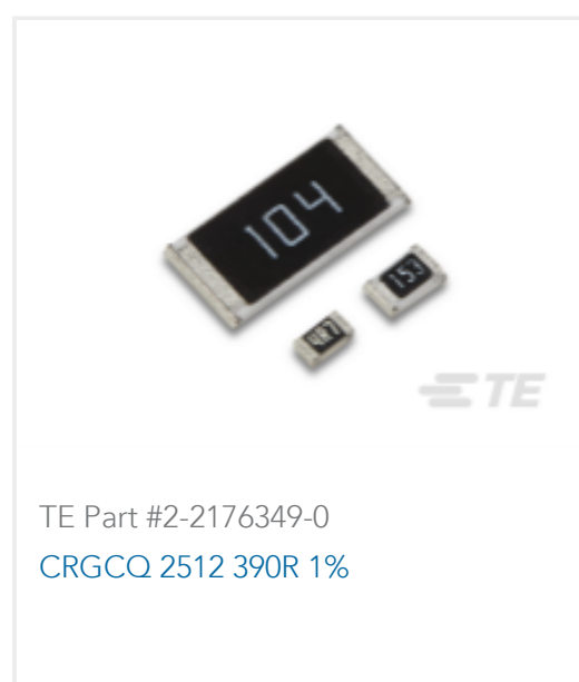
TE Part #2-2176349-0 CRGCO 2512 390R 1%