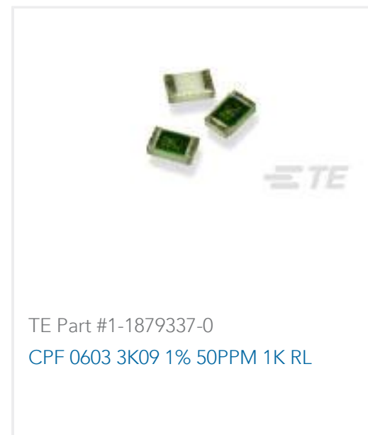
TE Part #1-1879337-0 CPF 0603 3K09 1% 50PPM 1K RL