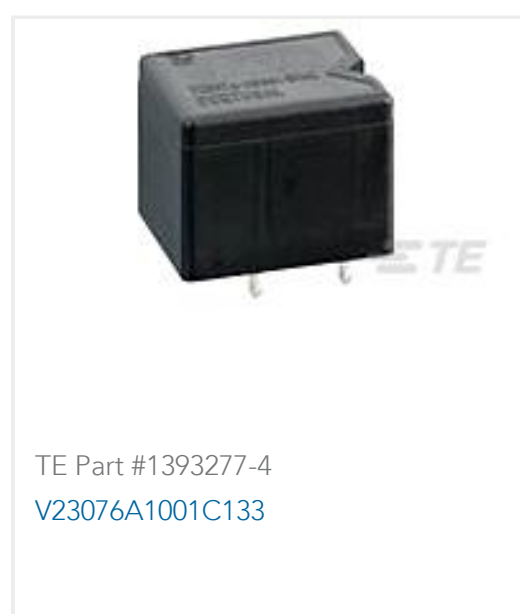
TE Part #1393277-4 V23076A1001C133