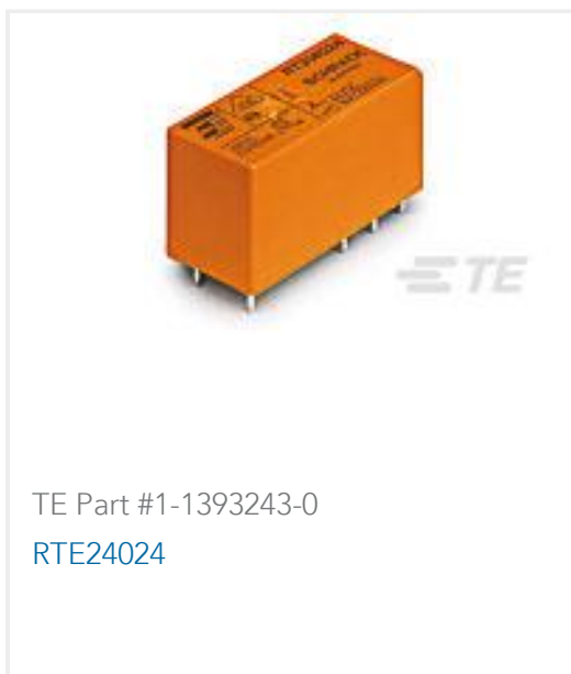
TE Part #1-1393243-0 RTE24024