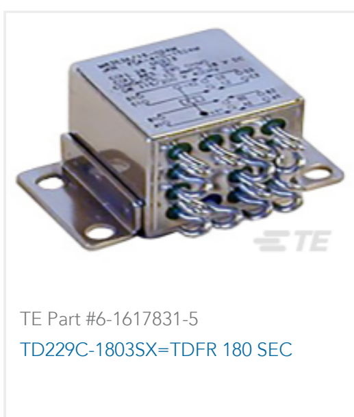
TE Part #6-1617831-5 TD229C-1803SX=TDFR 180 SEC