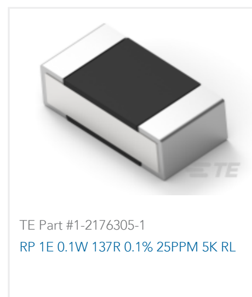
TE Part #1-2176305-1 RP 1E 0.1W 137R 0.1% 25PPM 5K RL