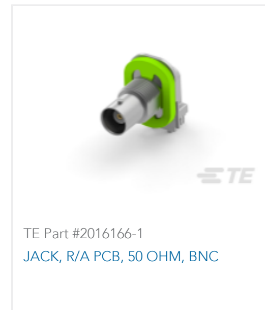
TE Part #2016166-1 JACK, R/A PCB, 50 OHM, BNC