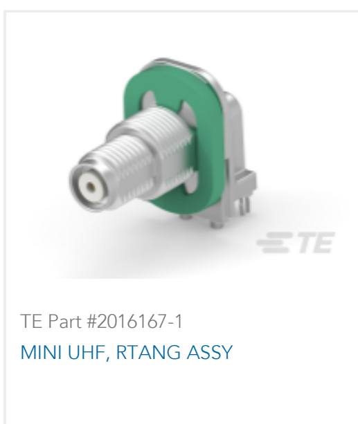
TE Part #2016167-1 MINI UHF, RTANG ASSY