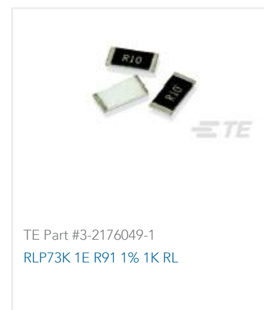
TE Part #3-2176049-1 RLP73K 1E R91 1% 1K RL