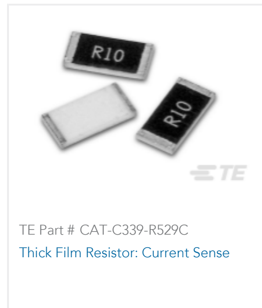
TE Part # CAT-C339-R529C Thick Film Resistor: Current Sense