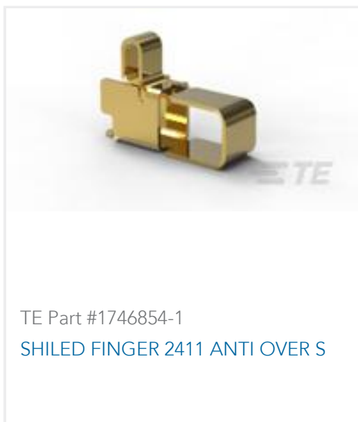
TE Part #1746854-1 SHILED FINGER 2411 ANTI OVER S