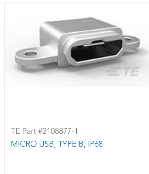
TE Part #2108877-1 MICRO USB, TYPE B, IP68