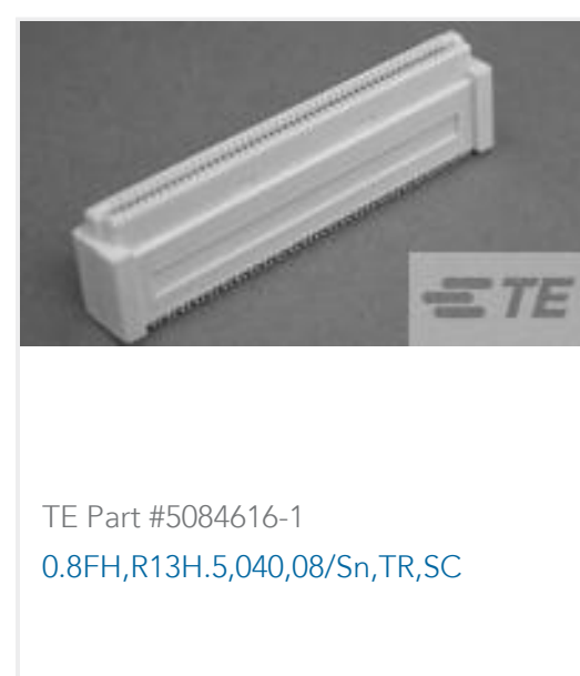
TE Part #5084616-1 0.8FH,R13H.5,040,08/Sn,TR,SC