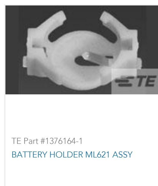
TE Part #1376164-1 BATTERY HOLDER ML621 ASSY