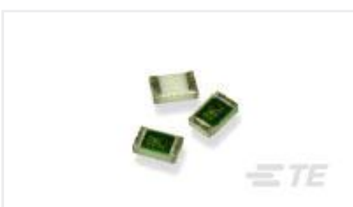
TE Part #1-1879338-2 CPF 0603 34K8 1% 50PPM 1K RL