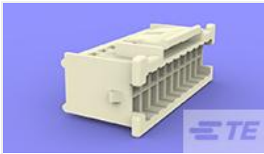
TE Part # 2-1969567-8 HOUSING, PLUG, GWT, DUAL ROW, EP2.5