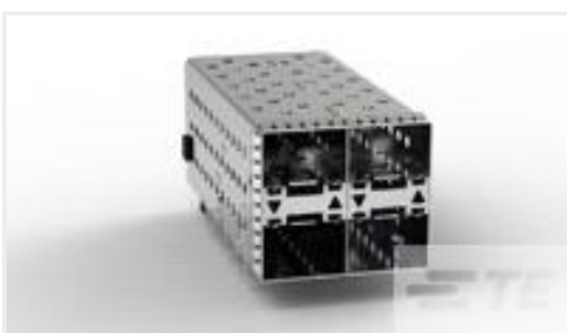
TE Part #2007637-7 SFP+ assy 2x2 spring Fingers Outer Lp Sn