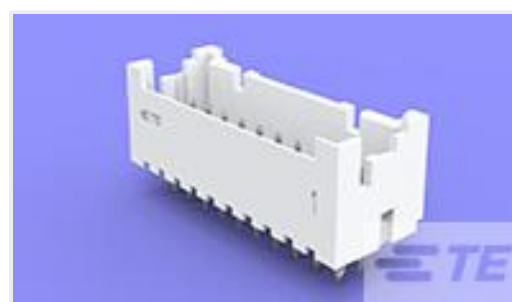
TE Part #1-1969543-6 ASSY, HDR, VERT, BOSSED, DUAL ROW, EP2.5