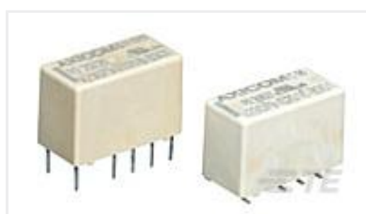
TE Part #5-1393789-3 V23079G2006B301