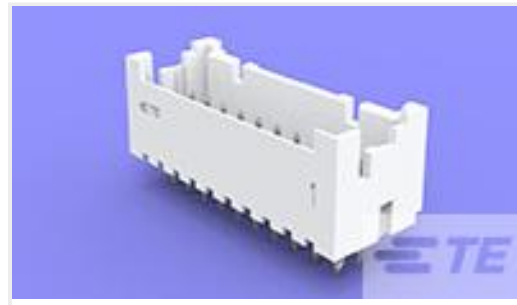
TE Part #1-1969543-4 ASSY, HDR, VERT, BOSSSED, DUAL ROW, EP2.5