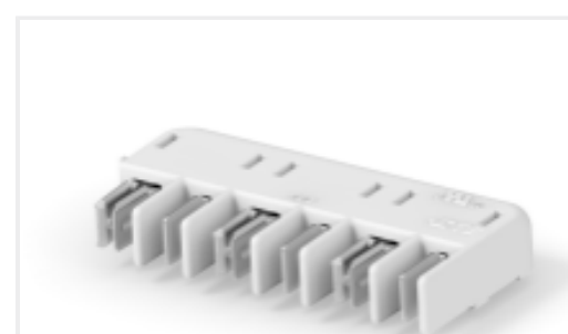
TE Part #2154640-3 Herm Blade & Recept assy w/latch & posts