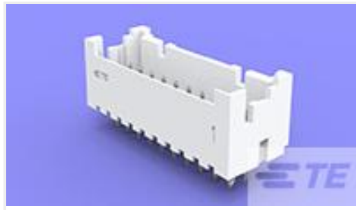
TE Part #1-1969543-8 ASSY, HDR, VERT, BOSSSED, DUAL ROW, EP2.5