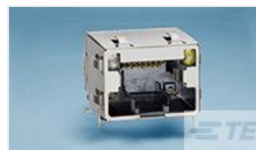
TE Part #2178126-1 Jack, CLOUDSPLITTER SMT SHIELDED