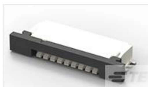
TE Part #1735265-8 1MM FPC HORZ.BOTTOM CONT. ASSY 8P (Au)