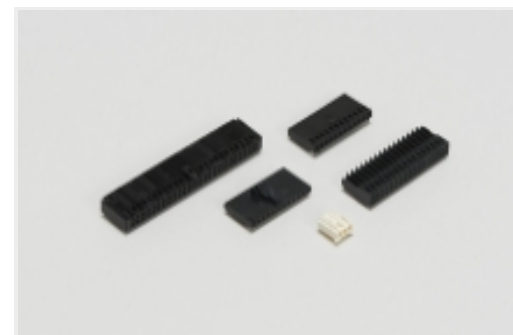
Wire-to-Board Connector Assemblies & Housings(305)