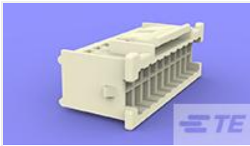
TE Part # 2-1969567-6 HOUSING, PLUG, GWT, DUAL ROW, EP2.5