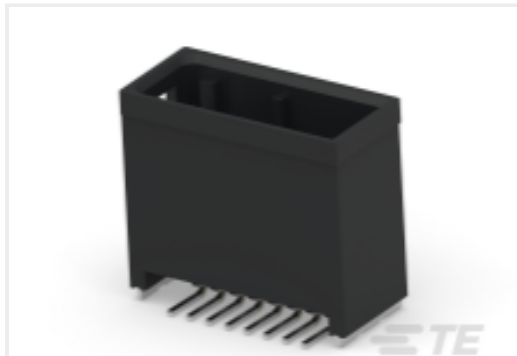
TE Part #1-2395010-1 2X8POS, NANOMQS, HDR ASSY, 180DEG, SMD, COD A