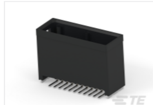
TE Part #2395016-1 2X11POS, NANOMQS, ASSY, 180DEG, SMD, COD A