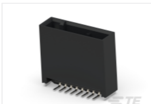
TE Part #2394812-1 8POS, TAB0.5X0.4, HDR ASSY, 180DEG, COD A