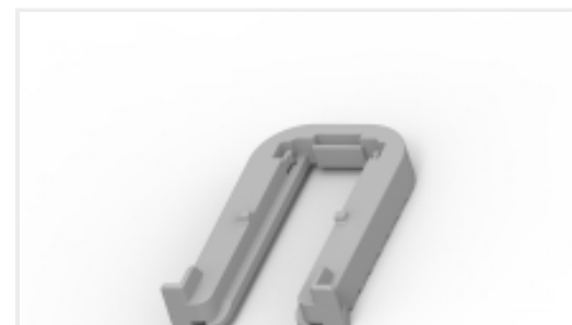
TE Part #1564411-6 SLIDE, TAB HSG GROUP E