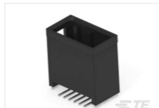
TE Part #1-2395006-1 2X6POS, NANOMQS, HDR ASSY, 180DEG, SMD, COD A