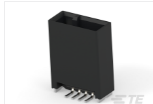
TE Part #1-2394804-1 4POS, TAB0.5X0.4, HDR ASSY, 180DEG, COD A