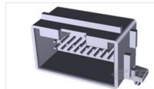
TE Part #966871-1 MOD2 ST-WANNE 2X10P