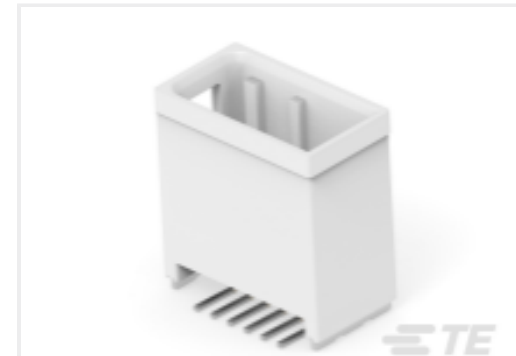
TE Part #1-2395006-2 12POS, TAB0.5X0.4, HDR ASSY, 180DEG, COD B