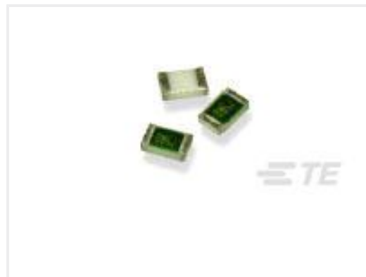
TE Part #7-1879338-4 CPF 0603 154K 1% 50PPM 1K RL