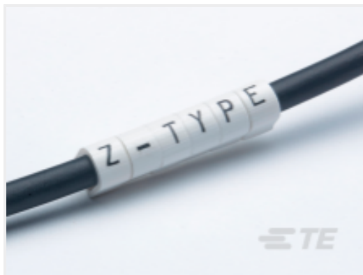
TE Part #EJ1952-000 06151412