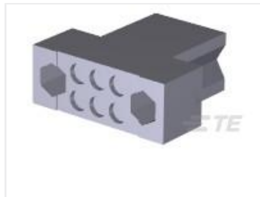
TE Part #202757-1 6 POS. FEM. BLOCK