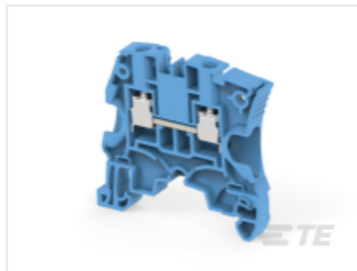
TE Part #1SNK506020R0000 ZS6-BL