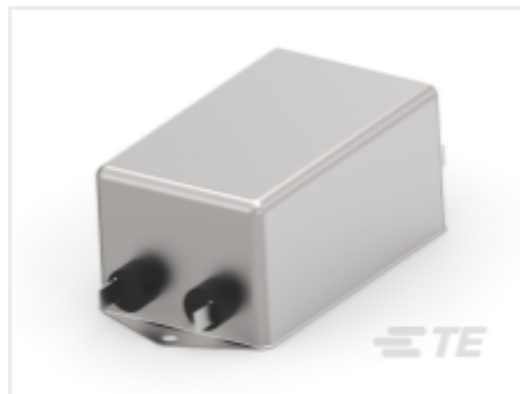
TE Part #2-6609037-6 12EP1=F8217