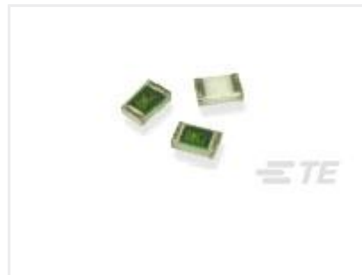
TE Part #2-2176094-6 RP 2A 0.25W 221K 0.1% 25PPM 1K RL