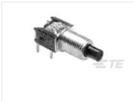
TE Part #1825100-4 TPF11CGRA004