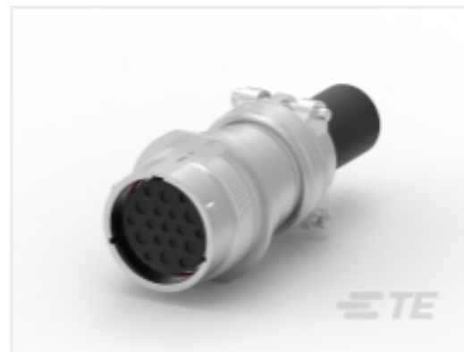
TE Part #HD34-24-19SE-059 REC,19P,AL,E,CBLCLMP BT,DRAIN,12 /16,S,MC