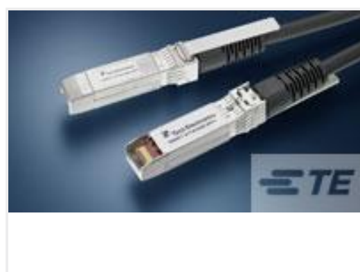
TE Part #1-2032757-1 C/A, ACTIVE SFP+ TO SFP+, TI 10M 28AWG