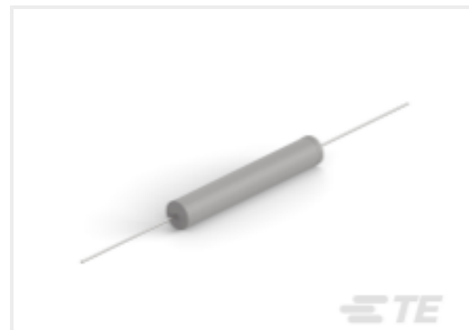
TE Part #8-2176416-6 9W STD M/OX 5% 180K