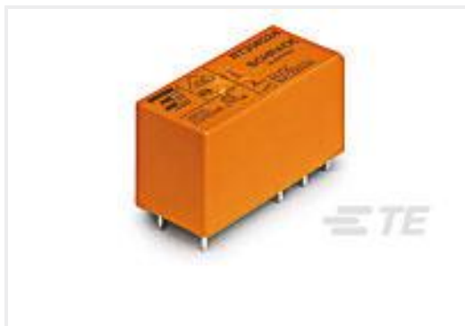
TE Part #2-1393240-4 RT33K024