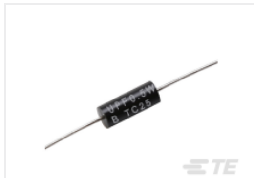
TE Part #1-2176163-2 UPF50 0.1% 5PPM 330R