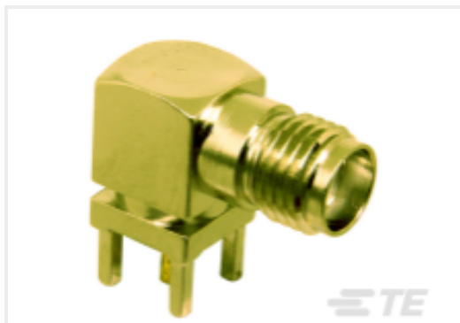
TE Part #CONSMA002-G SMA Jack 50 Ohm PCB Through Hole