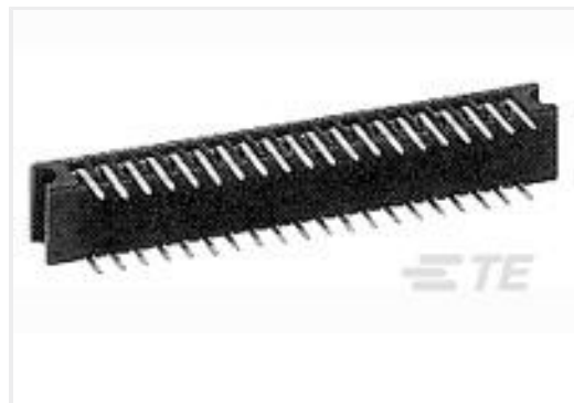
TE Part #5-532956-5 30 MODII 2PC CE RCPT ASSY, RoHS