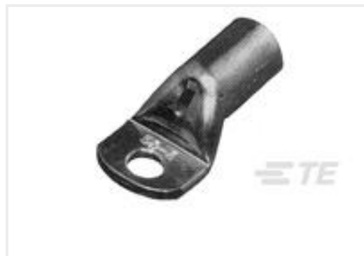
TE Part #710031-8 XCT 10-10