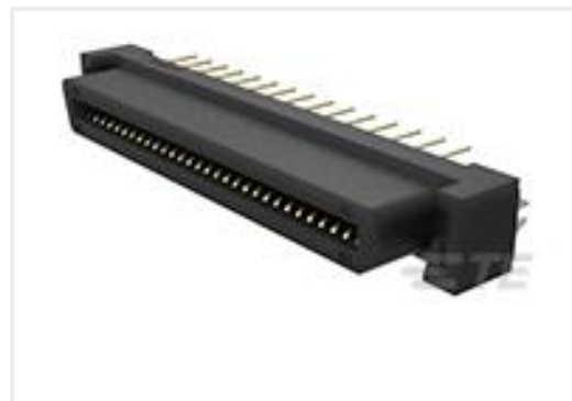
TE Part #1734101-8 Champ050 series,80pos,Au over PdNi