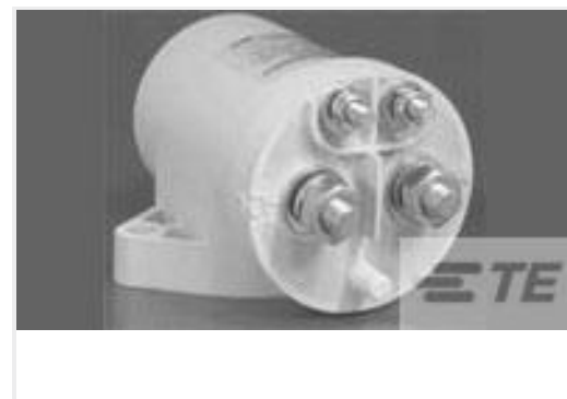
TE Part #5-1618387-7 LEV200A5NAF=RELAY, 24Vdc SPST NO