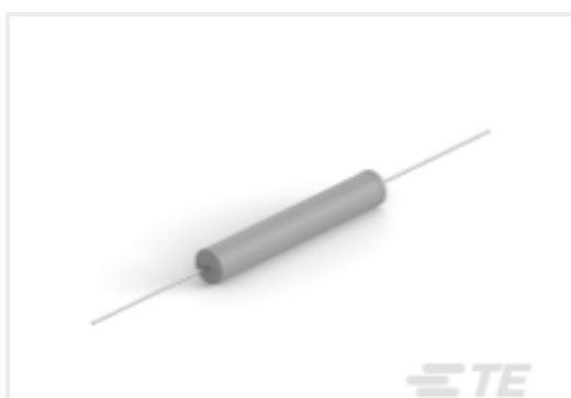
TE Part #8-2176416-5 9W STD M/OX 5% 160K