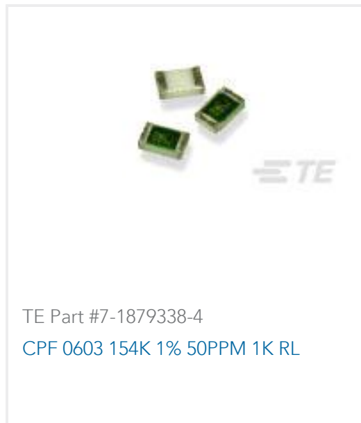
TE Part #7-1879338-4 CPF 0603 154K 1% 50PPM 1K RL