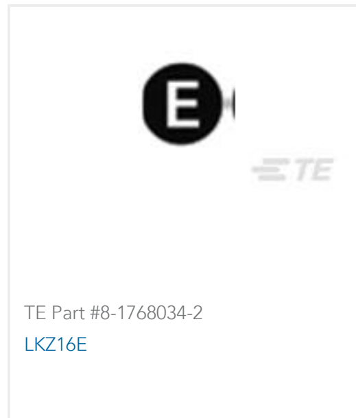
TE Part #8-1768034-2 LKZ16E