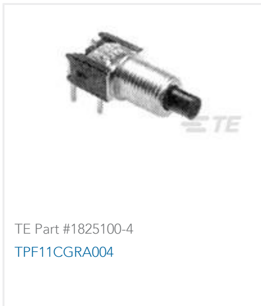
TE Part #1825100-4 TPF11CGRA004