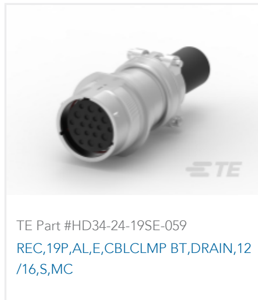
TE Part #HD34-24-19SE-059 REC,19P,AL,E,CBLCLMP BT,DRAIN,12 /16,S,MC