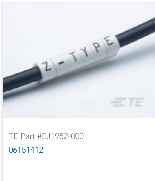
TE Part #EJ1952-000 06151412