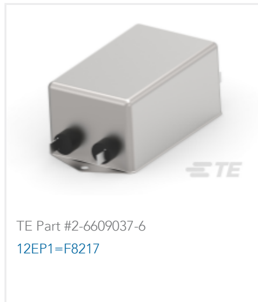
TE Part #2-6609037-6 12EP1=F8217