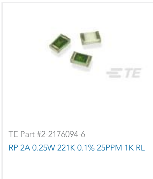
TE Part #2-2176094-6 RP 2A 0.25W 221K 0.1% 25PPM 1K RL