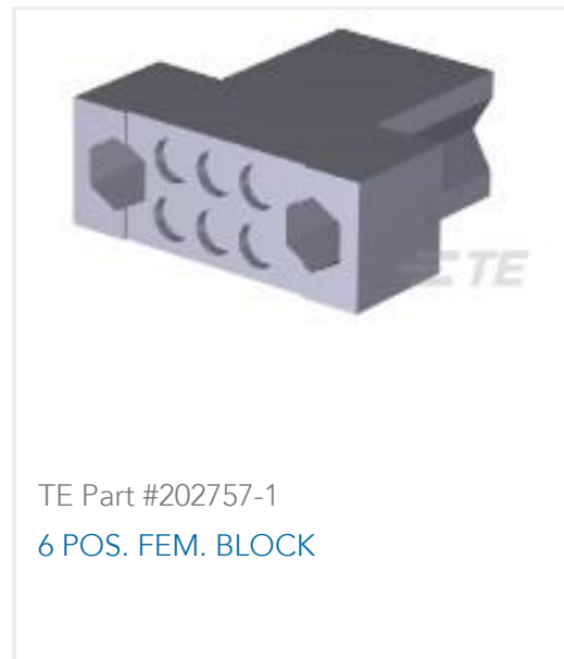
TE Part #202757-1 6 POS. FEM. BLOCK