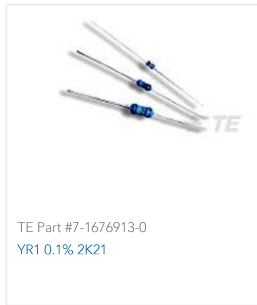
TE Part #7-1676913-0 YR1 0.1% 2K21