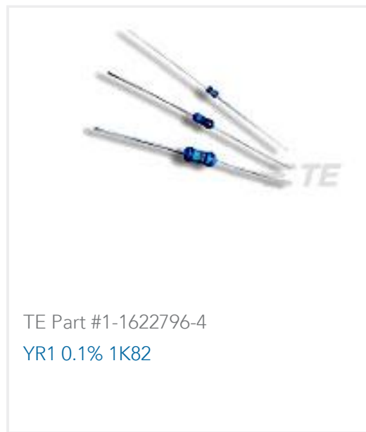
TE Part #1-1622796-4 YR1 0.1% 1K82