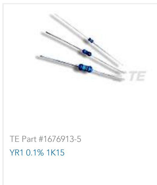
TE Part #1676913-5 YR1 0.1% 1K15