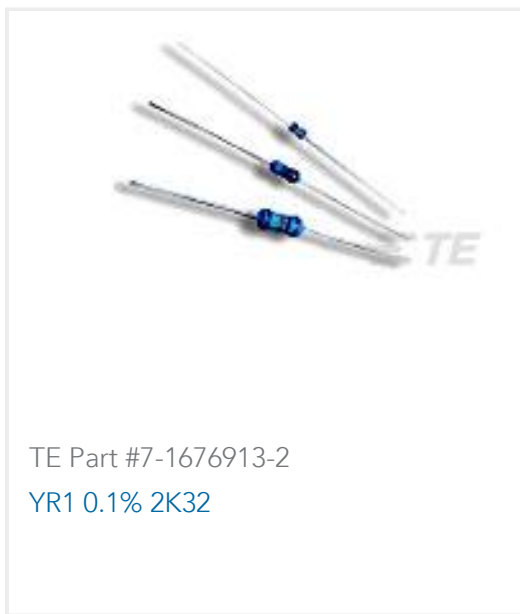
TE Part #7-1676913-2 YR1 0.1% 2K32