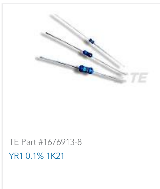
TE Part #1676913-8 YR1 0.1% 1K21