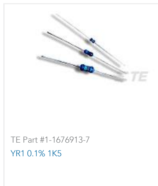
TE Part #1-1676913-7 YR1 0.1% 1K5