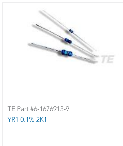
TE Part #6-1676913-9 YR1 0.1% 2K1