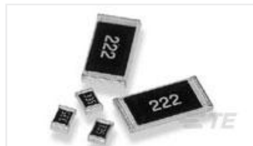
TE Part #9-1879507-2 CRGH0603 1% 39R 0.2W