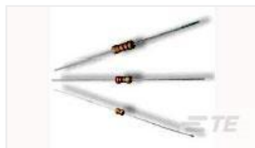
TE Part #1623927-1 CFR16 5% 100K