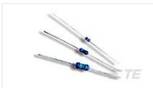
TE Part #1622519-1 LR1 1% 56K