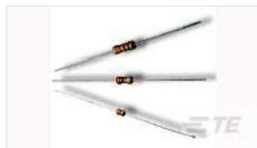
TE Part #3-1623925-2 CFR100 5% 33K