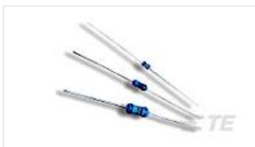
TE Part #1622578-1 LR1 1% 82K