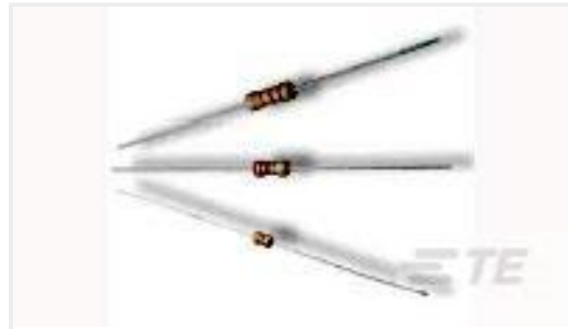
TE Part # 1623932-8 CFR50 5% 10K