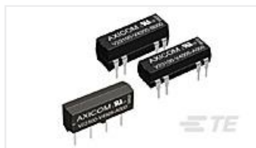
TE Part #4-1393763-4 V23100V4505A000