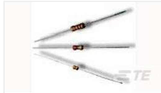
TE Part # 1623925-2 CFR100 5% 100R