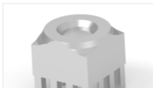
TE Part #225689-E POWELM BUCHSE RUNDM M5 6 2,54 * EP 6 CUS