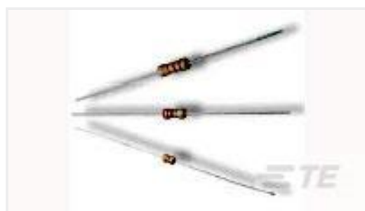
TE Part #4-1623933-7 CFR50 5% 5K6