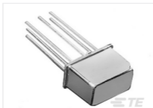
TE Part #2-1617146-8 JMGACDD-26LW = M39016/19-042L