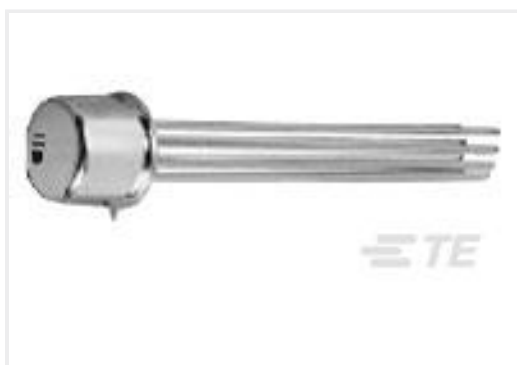
TE Part #1617128-2 JMSCD-12XM = M39016/16-035M