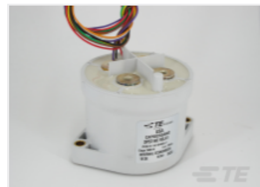
TE Part #6-1618406-7 CAP202ASAND=Relay, DPST-NO 28V