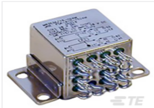
TE Part #2-1617813-1 TD229-1203P= TDFR 120SEC M83726 /29-1203P