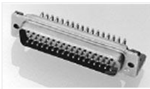
TE Part #1757836-2 AMPLIMITE, R/A RCPT ASY, 109, ZN, 2