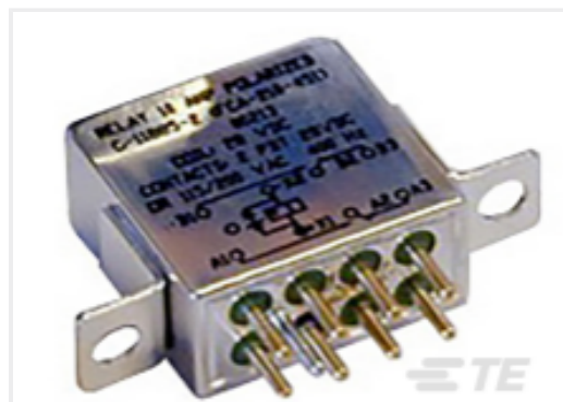
TE Part #3-1617752-9 FCA-215-BY4