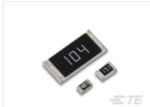
TE Part #6-2176341-1 CRGCO 0805 1M0 1%