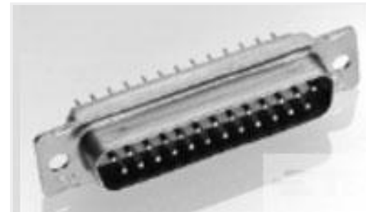
TE Part #1757830-3 AMPLIMITE, RCPT ASY, POSTD, 109, ZN, 3