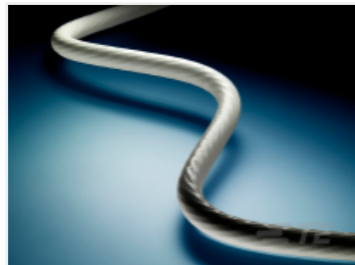
TE Part #EK0486-000 SHF260-0113-00-0