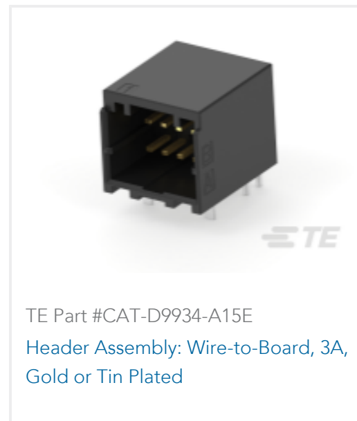
TE Part #CAT-D9934-A15E Header Assembly: Wire-to-Board, 3A, Gold or Tin Plated