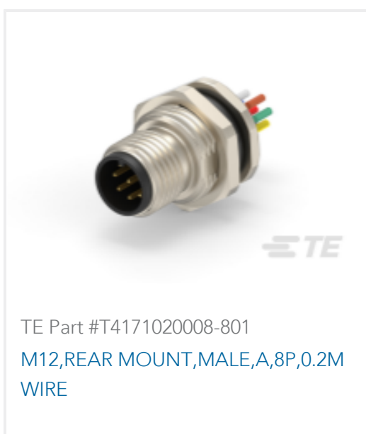
TE Part #T4171020008-801 M12,REAR MOUNT,MALE,A,8P,0.2M WIRE