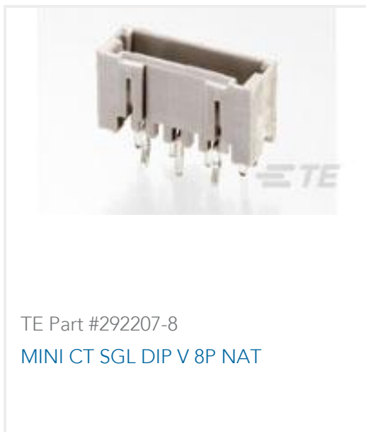
TE Part #292207-8 MINI CT SGL DIP V 8P NAT