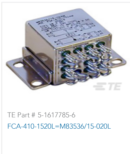
TE Part # 5-1617785-6 FCA-410-1520L=M83536/15-020L