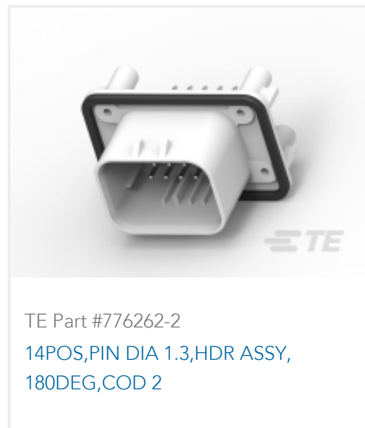
TE Part #776262-2 14POS,PIN DIA 1.3,HDR ASSY, 180DEG,COD 2