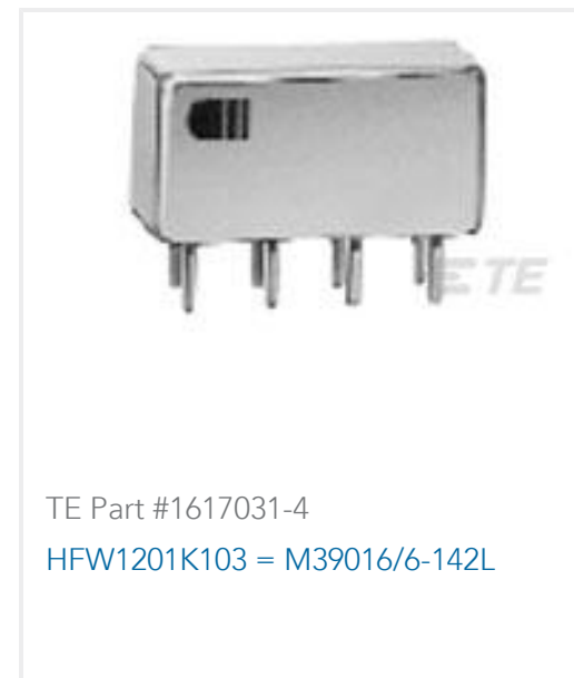
TE Part #1617031-4 HFW1201K103 = M39016/6-142L