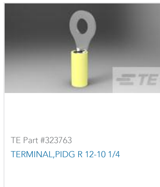
TE Part #323763 TERMINAL,PIDG R 12-10 1/4