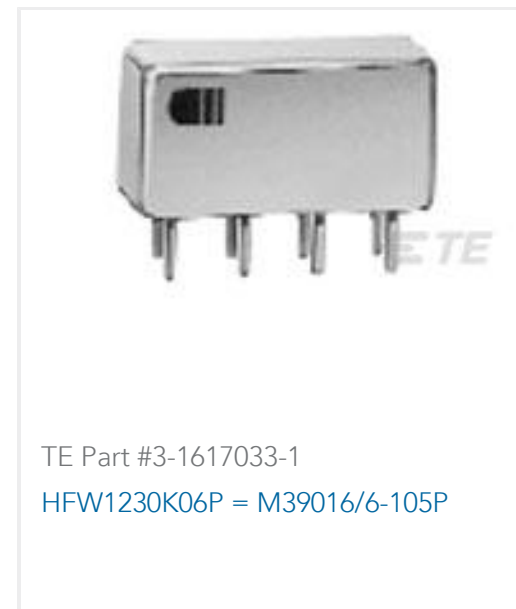
TE Part #3-1617033-1 HFW1230K06P = M39016/6-105P