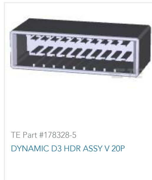
TE Part #178328-5 DYNAMIC D3 HDR ASSY V 20P